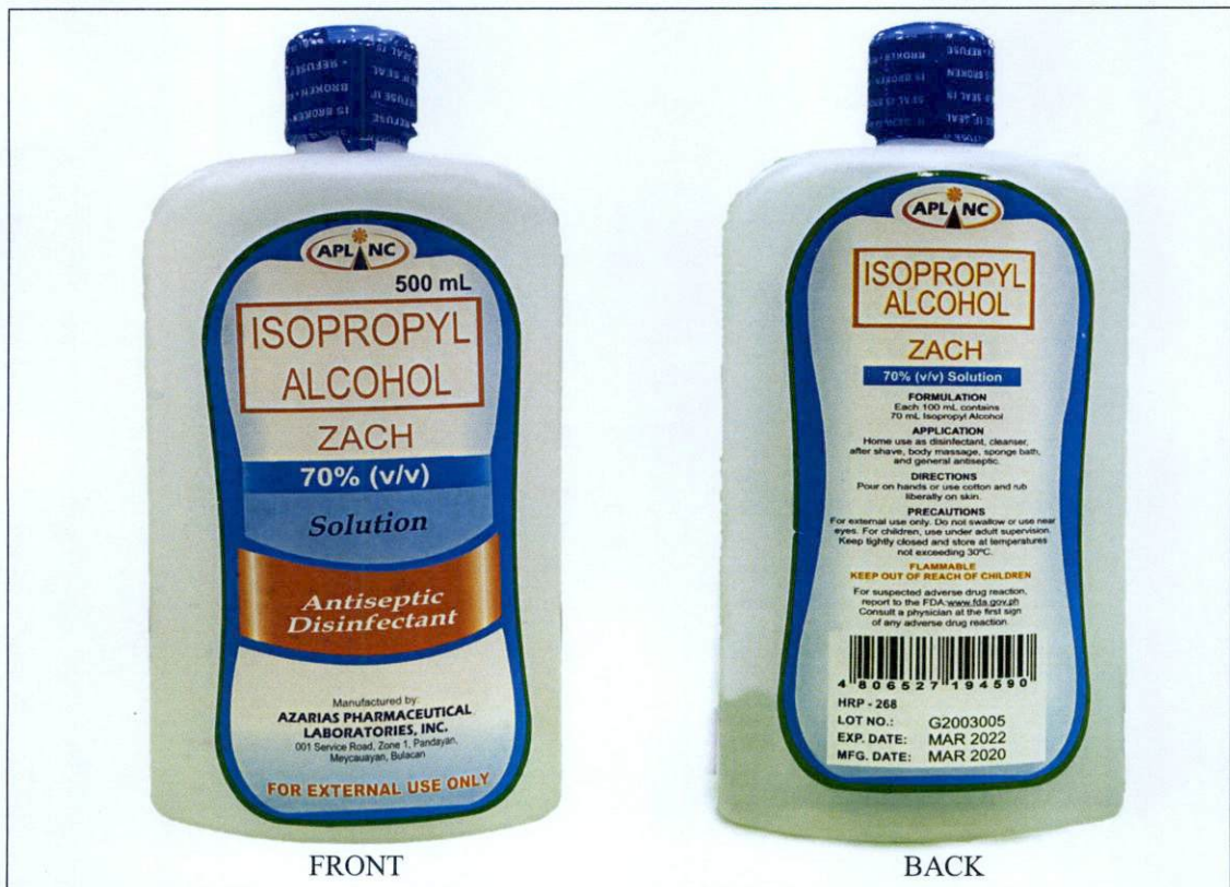
Figure 1. Isopropyl Alcohol 70% (v/v) Solution (Zach) for recall