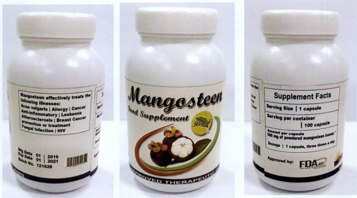
Figure 4. Unregistered HERBAL Mangosteen Food Supplement

The FDA verified through post-marketing surveillance that the abovementioned food supplements are not authorized and the Certificates of Product Registration have not been issued. Pursuant to the Republic Act No. 9711, otherwise known as the “Food and Drug Administration Act of 2009”, the manufacture, importation, exportation, sale, offering for sale, distribution, transfer, non-consumer use, promotion, advertising or sponsorship of health products without the proper authorization is prohibited.