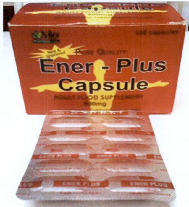
Figure 1. Unregistered ENER-PLUS Adult Food Supplement

The Food and Drug Administration (FDA) advises the public from purchasing and consuming the following unregistered food supplements: