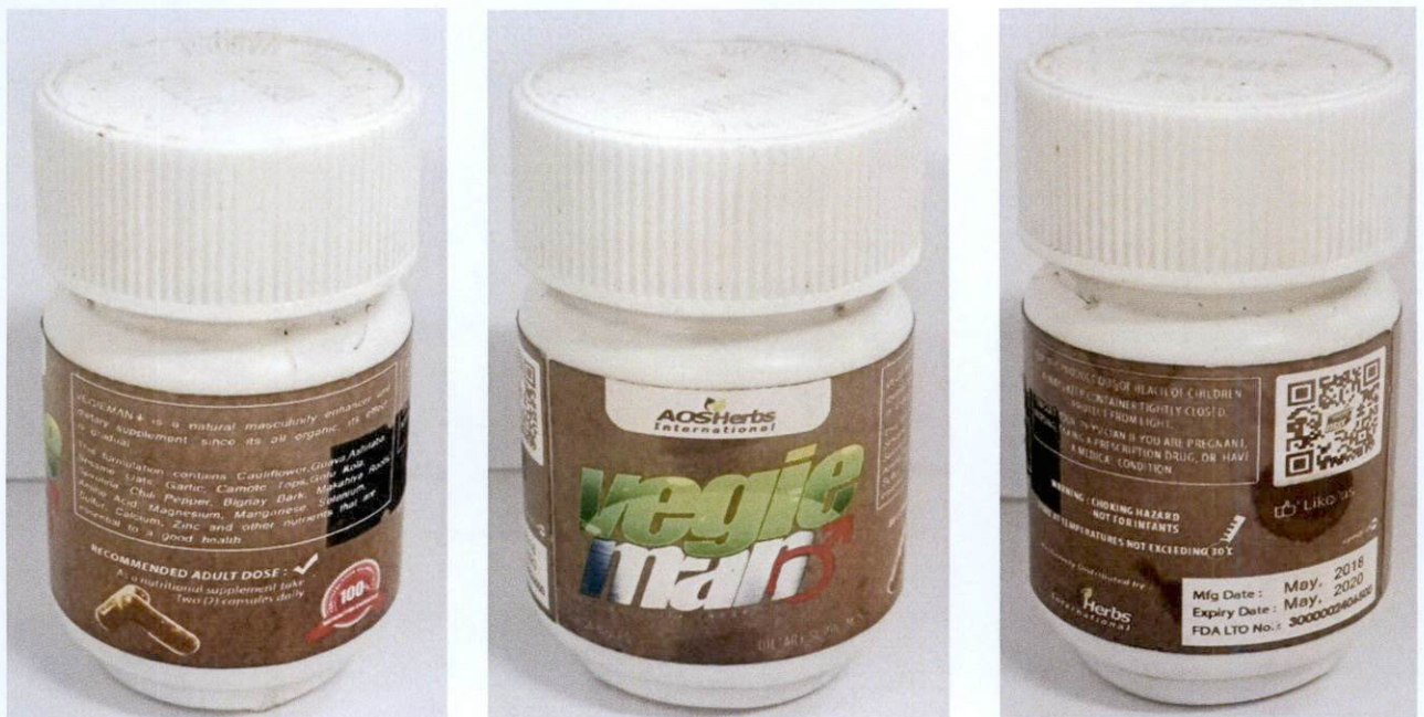
Figure 3. Unregistered AOSHERBS INTERNATIONAL VegieMan+ Dietary Supplements