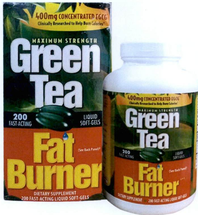
Figure 2. Unregistered MAXIMUM STRENGTH Green Tea Fat Burner Dietary Supplement