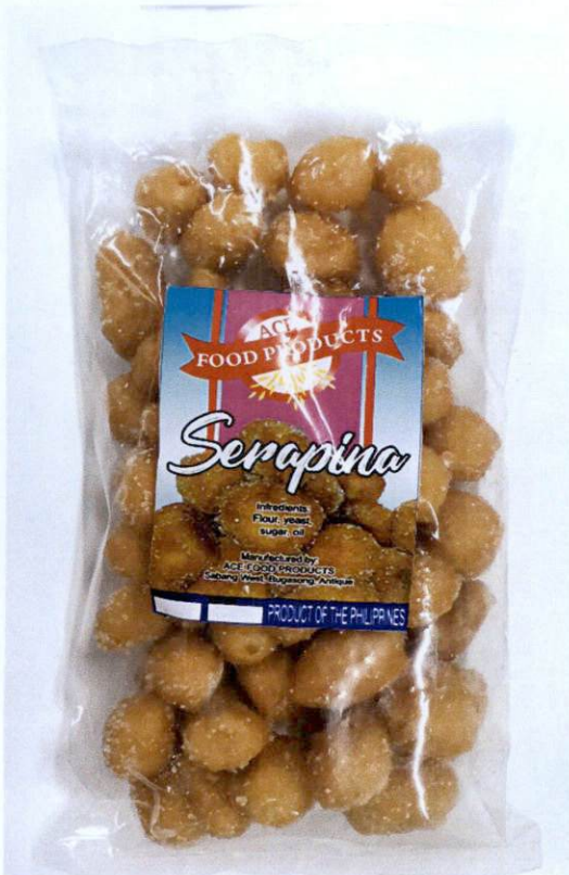
Figure 4. Unregistered ACE FOOD PRODUCTS Serapina