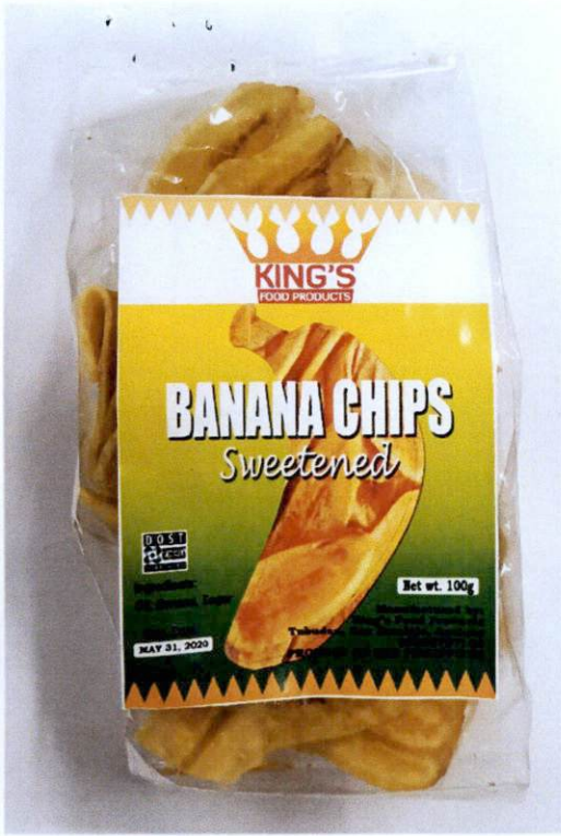
Figure 2. Unregistered KING'S FOOD PRODUCTS Sweetened Banana Chips