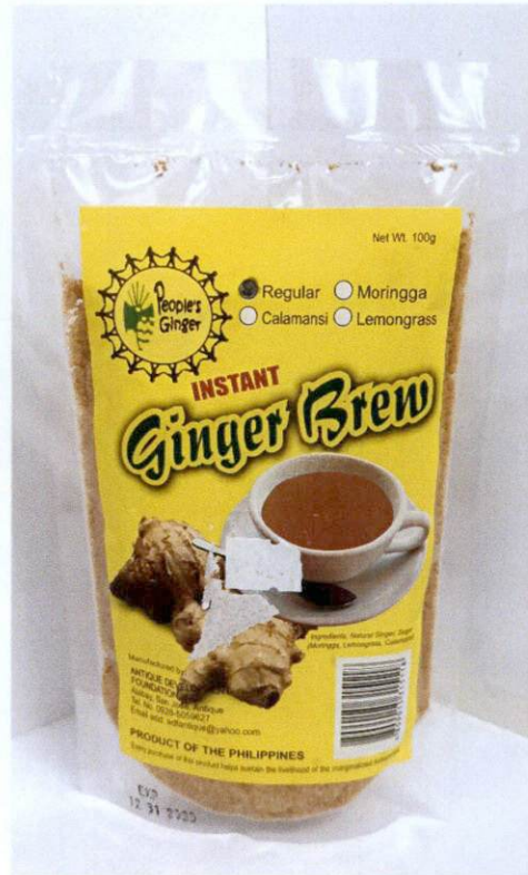
Figure 5. Unregistered PEOPLE'S GINGER Instant Ginger Brew-Regular