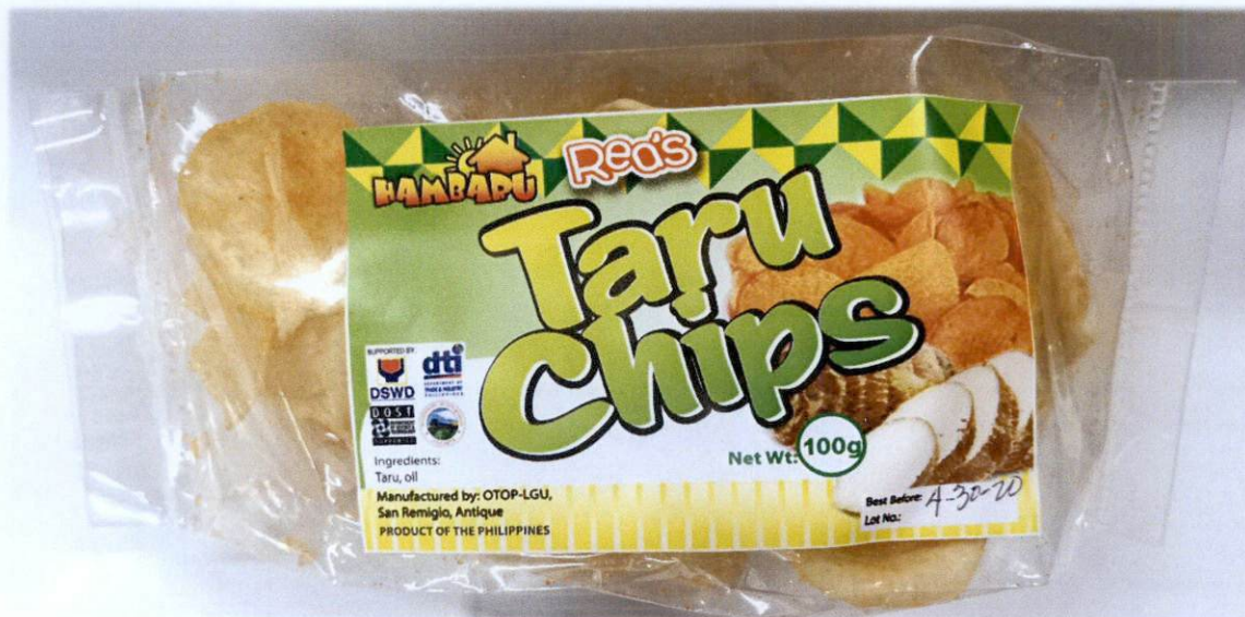
Figure 1. Unregistered HAMBARU REA'S Taru Chips

The Food and Drug Administration (FDA) advises the public from purchasing and consuming the following unregistered food products: