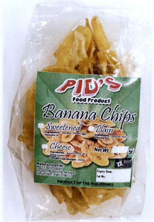
Figure 3. Unregistered PID'S FOOD PRODUCTS Banana Chips