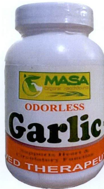
Figure 3. Unregistered MASA Odorless Garlic Capsules