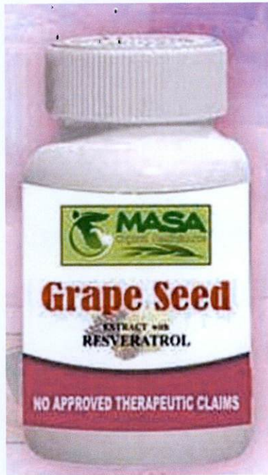
Figure 2. Unregistered MASA Grapeseed Extract with Resveratrol Capsules