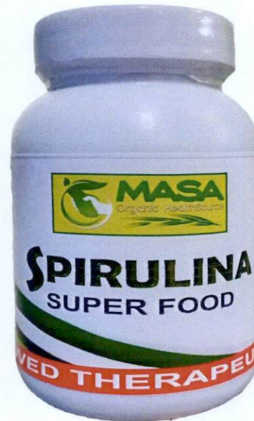
Figure 5. Unregistered MASA Spirulina Super Food Capsules

The FDA verified through post-marketing surveillance that the abovementioned food products are not authorized and the Certificates of Product Registration (CPR) have not been issued. Pursuant to the Republic Act No. 9711, otherwise known as the “Food and Drug Administration Act of 2009”, the manufacture, importation, exportation, sale, offering for sale, distribution,