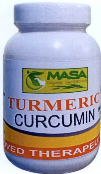
Figure 4. Unregistered MASA Turmeric Curcumin Capsules