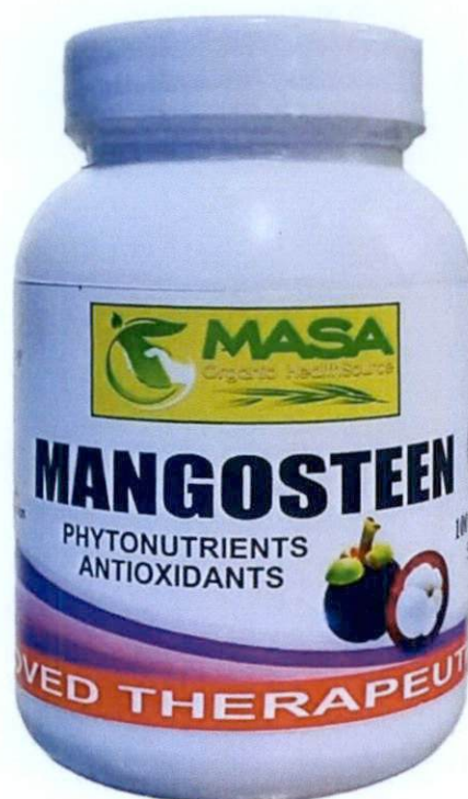
Figure 1. Unregistered MASA Mangosteen Xanthonex Capsules

The Food and Drug Administration (FDA) advises the public from purchasing and consuming the following unregistered food products: