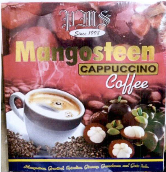
Figure 2. Unregistered PMS Mangosteen Cappuccino Coffee