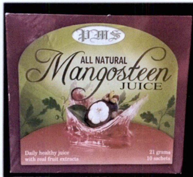
Figure 4. Unregistered PMS All Natural Mangosteen Juice