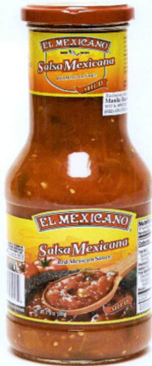
Figure 2. Unregistered EL MEXICANO Salsa, Mexicana Red Mexican Sauce - Mild, 500g