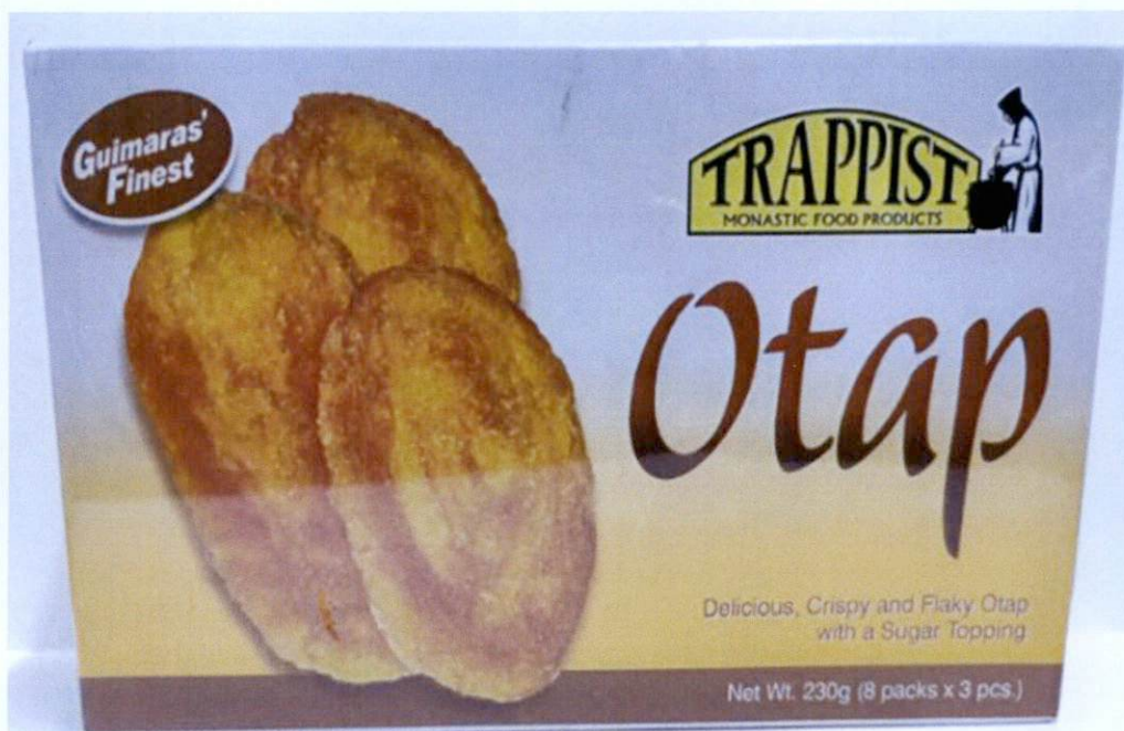
Figure 1. Unregistered TRAPPIST MONASTIC FOOD PRODUCTS Otap, Net Wt. 230g (8 Packs x 3 pcs)

The Food and Drug Administration (FDA) warns the public from purchasing and consuming the following unregistered food products: