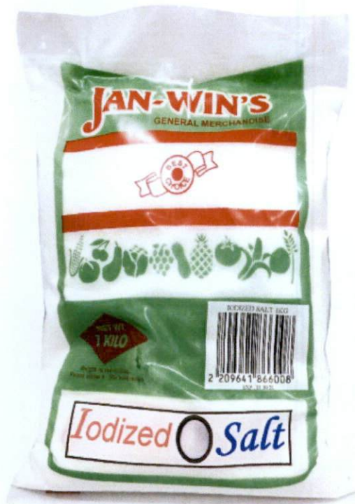
Figure 3. Unregistered JAN-WINS Iodized Salt, 1kg