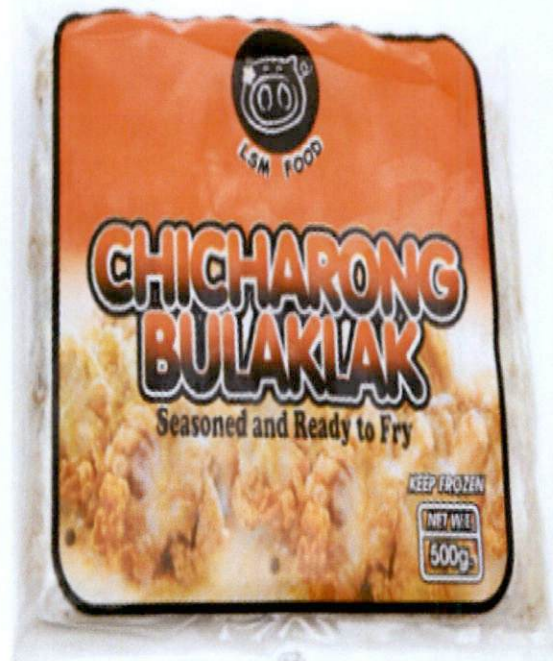
Figure 5. Unregistered LSM FOOD Chicharong Bulaklak, 500g