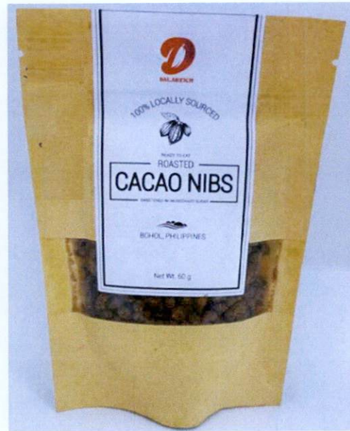
Figure 3. Unregistered DALAREICH Roasted Cacao Nibs Sweetened with Muscovado Sugar, Net Wt. 60g