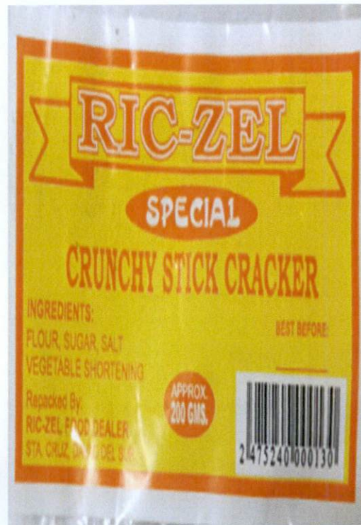
Figure 5. Unregistered RIC-ZEL Special Crunchy Stick Cracker, Approx. 200gms