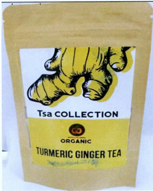
Figure 2. Unregistered MY WELNNESS IDEAS TSA COLLECTION Organic Turmeric Ginger Tea, 26gms