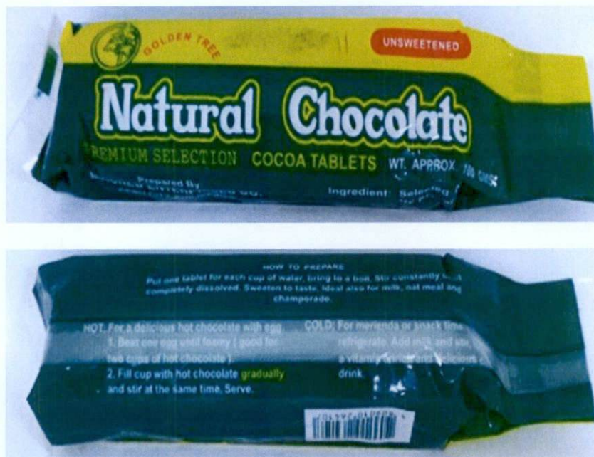
Figure 1. Unregistered GOLDEN TREE Natural Chocolate Premium Selection Cocoa Tablets, Unsweetened, Wt Approx. 100gms

The Food and Drug Administration (FDA) warns the public from purchasing and consuming the following unregistered food products: