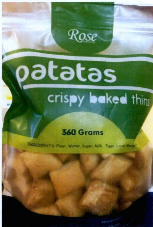
Figure 4. Unregistered ROSE Patatas Crispy Baked Thins, 360 Grams