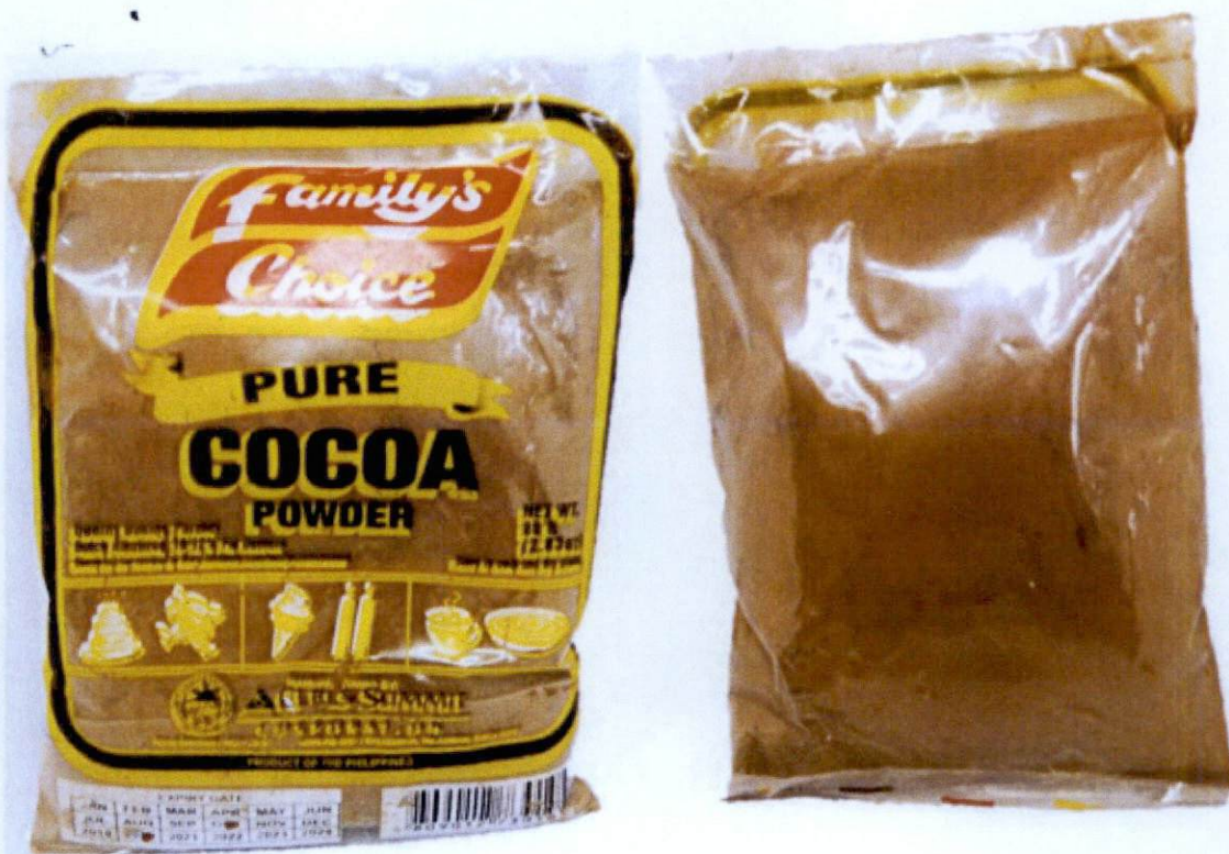
Figure1. Registered FAMILY'S CHOICE Pure Cocoa Powder with FR No. 4000006078304 valid until 13 April 2025

The Food and Drug Administration (FDA) informs the public that the food product has been registered by the Market Authorization Holder CERES SUMMIT CORPORATION in accordance to existing FDA rules and regulations: