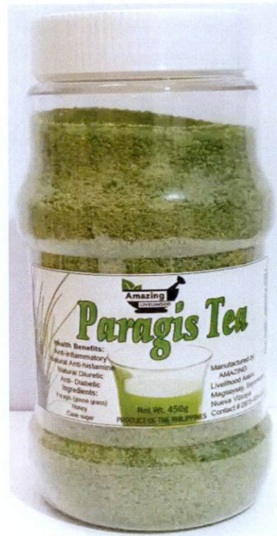
Figure 3. Unregistered AMAZING LIVELIHOOD Paragis Tea, Net Wt. 450g