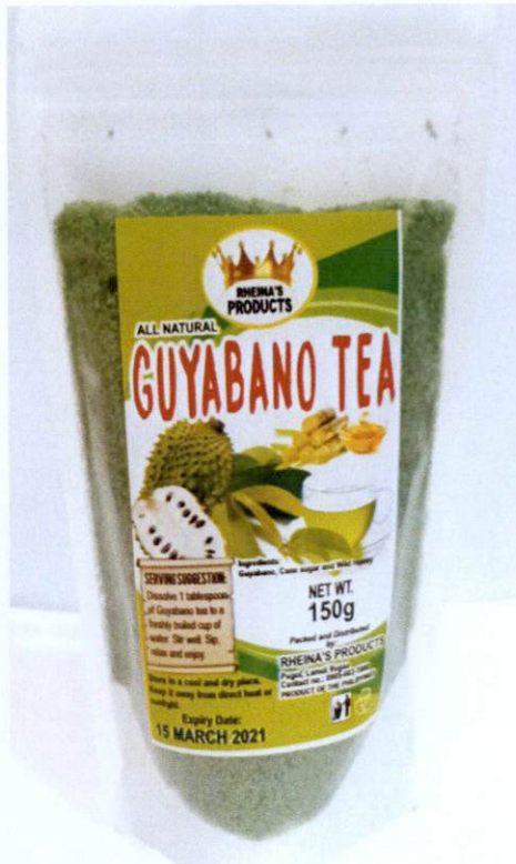
Figure 2. Unregistered RHEINA'S PRODUCTS All Natural Guyabano Tea, Net Wt. 150g