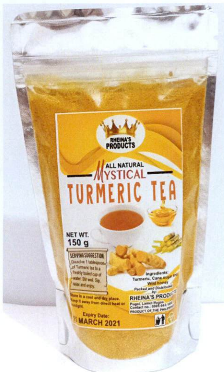
Figure 4. Unregistered RHEINA'S PRODUCTS All Natural Mystical Turmeric Tea, Net Wt. 150g