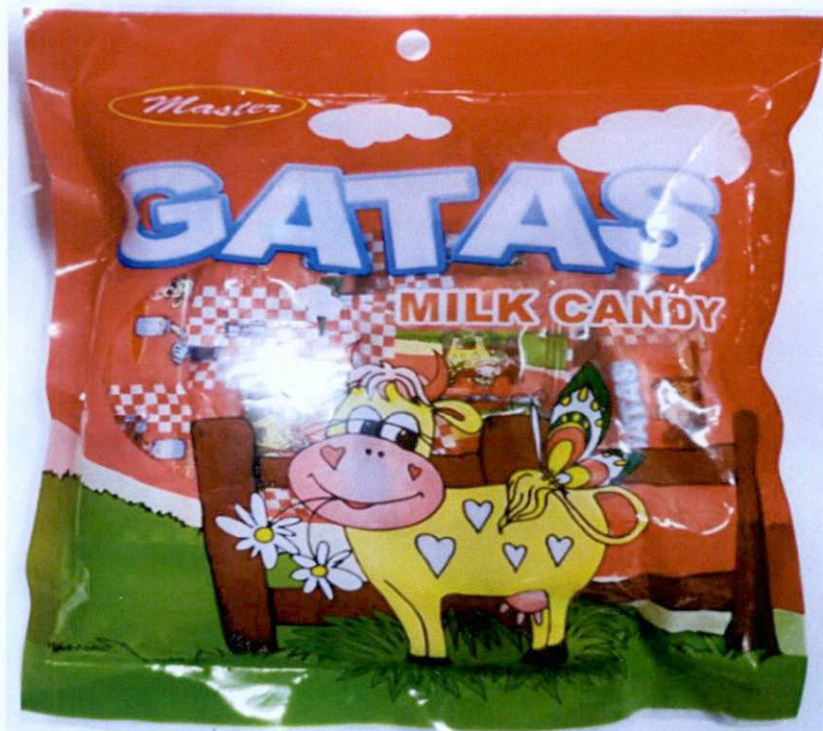
Figure 1. Unregistered MASTER GATAS Milk Candy, 40pcs.

The Food and Drug Administration (FDA) warns the public from purchasing and consuming the following unregistered food products: