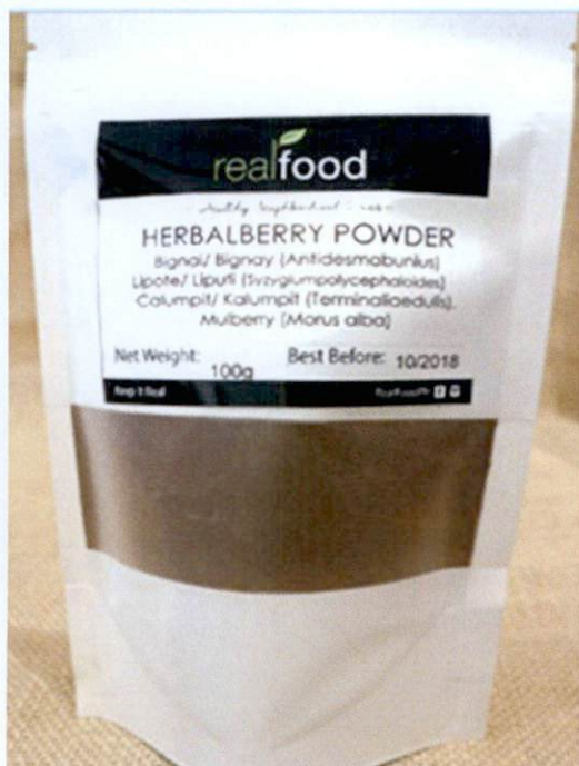
Figure 4. Unregistered REALFOOD HerbalBerry Powder Bignai / Bignay ( Antidesmabunius ) Lipote / Liputi ( Syzygiumpolycephalaide ) Calumpit / Kalumpit ( Terminaliaedulis ) Mulberry ( Morus alba )