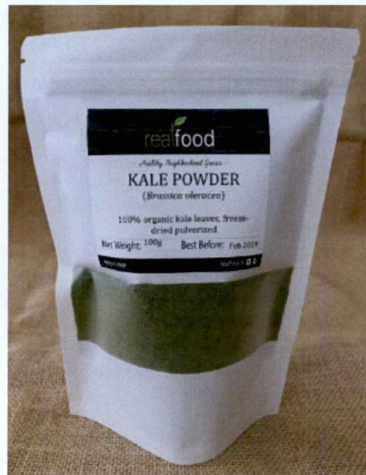
Figure 5. Unregistered REALFOOD Kale Powder ( Brassica oleracea )