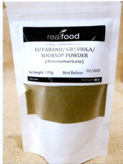
Figure 3. Unregistered REALFOOD Guyabano/Graviola/Soursop Powder ( Annonamuricata )