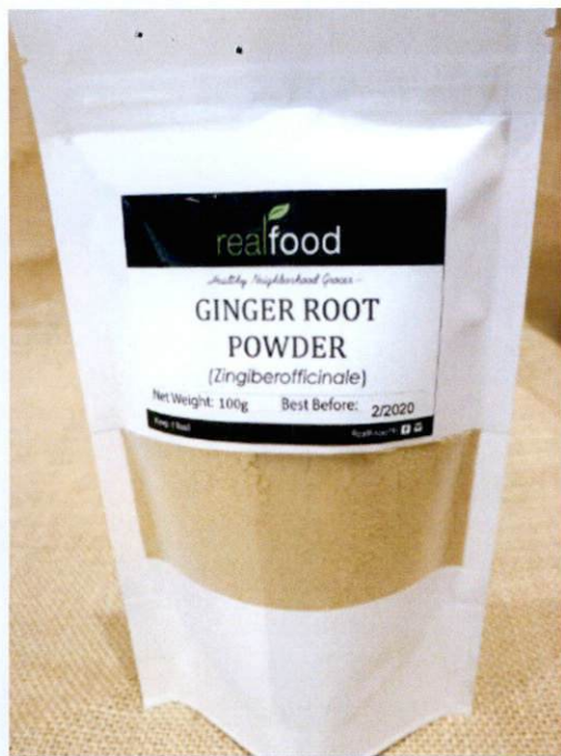
Figure 2. Unregistered REALFOOD Ginger Root Powder ( Zingiberoffinale )