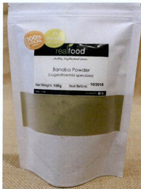
Figure 1. Unregistered REALFOOD Banaba Powder ( Lagerstroemia speciosa )

The Food and Drug Administration (FDA) advises the public from purchasing and consuming the following unregistered food products: