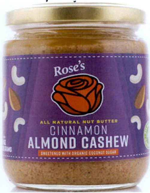
Figure 2. Unregistered ROSE'S All Natural Nut Butter Cinnamon Almond Cashew Sweetened with Organic Coconut Sugar