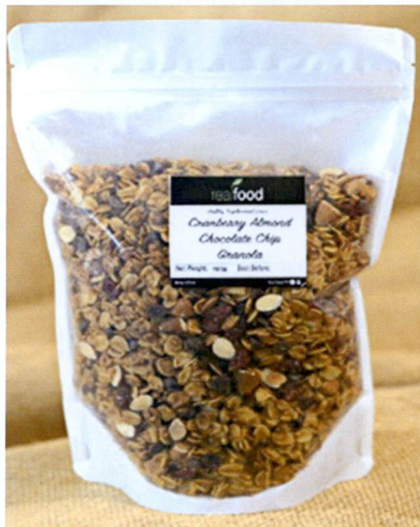
Figure 1. Unregistered REALFOOD Cranberry Almond Chocolate Chip Granola

The Food and Drug Administration (FDA) advises the public from purchasing and consuming the following unregistered food products: