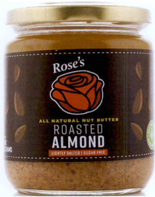
Figure 3. Unregistered ROSE'S All Natural Nut Butter Roasted Almond Lightly Salted | Sugar Free