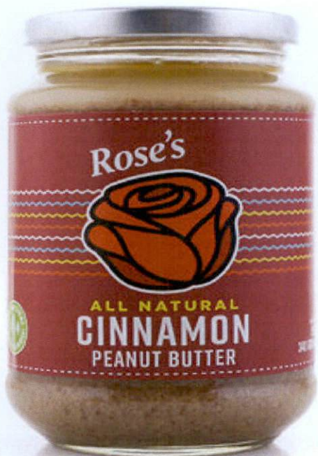
Figure 4. Unregistered ROSE'S All Natural Cinnamon Peanut Butter