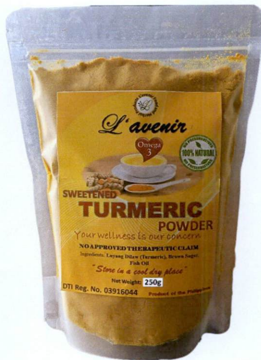
Figure 3. Unregistered L'AVENIR Sweetened Turmeric Powder