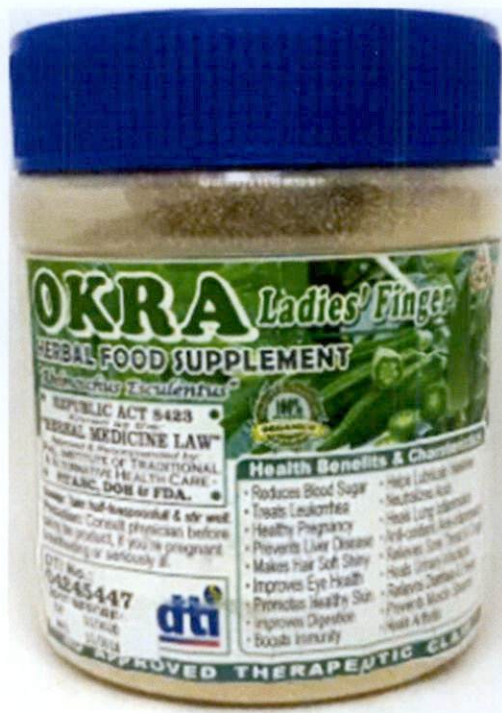
Figure 5. Unregistered OKRA (Ladies Finger) Tea Organic Herbal Food Supplement