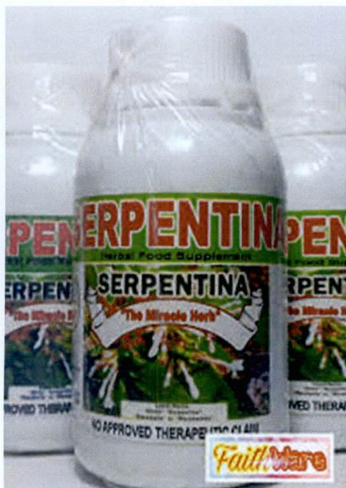
Figure 4. Unregistered THE MIRACLE HERB Serpentina Herbal Food Supplement