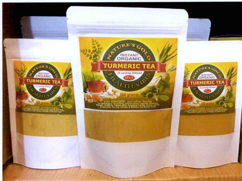
Figure 1. Unregistered NATURE'S GOLD 17 in 1 Instant Organic Turmeric Tea (Luyang Dilaw)

The Food and Drug Administration (FDA) advises the public from purchasing and consuming the following unregistered food products and food supplements: