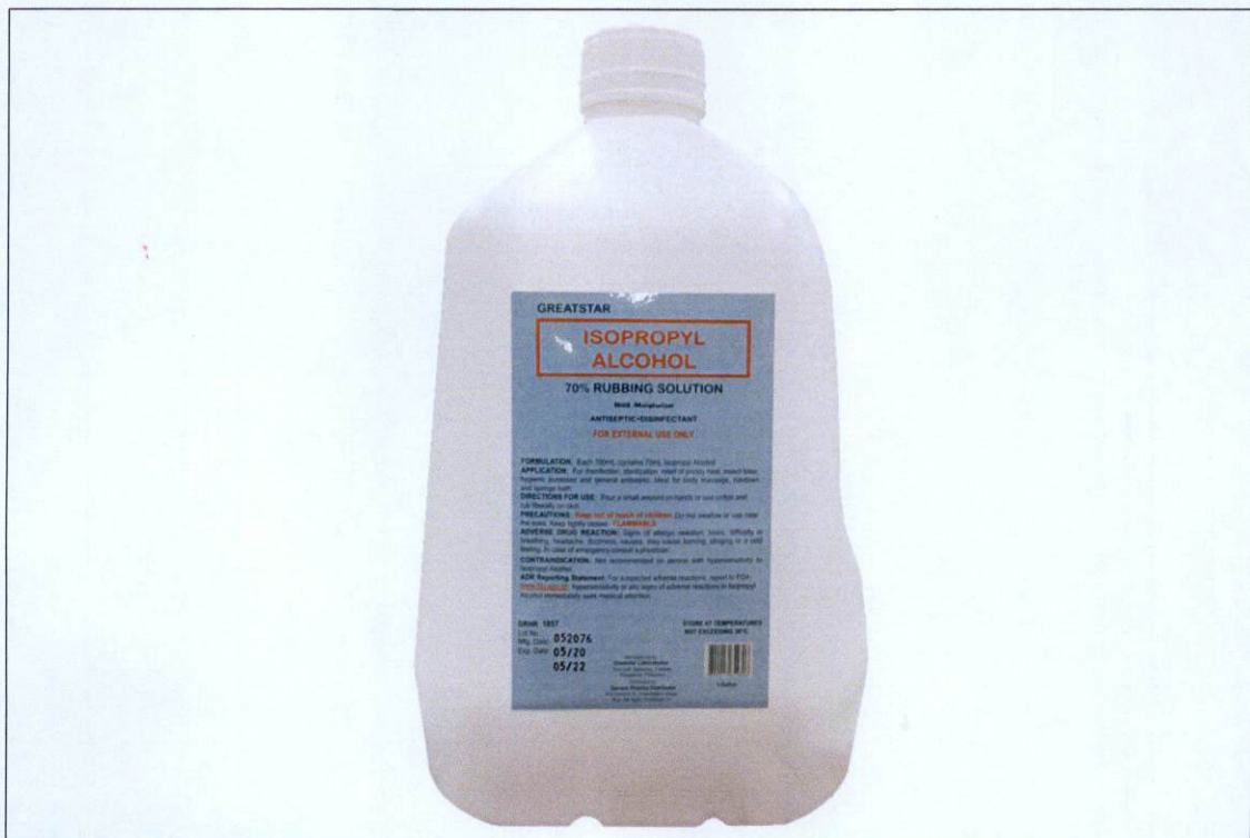
Figure 1. Isopropyl Alcohol 70% Rubbing Solution with Moisturizer for recall