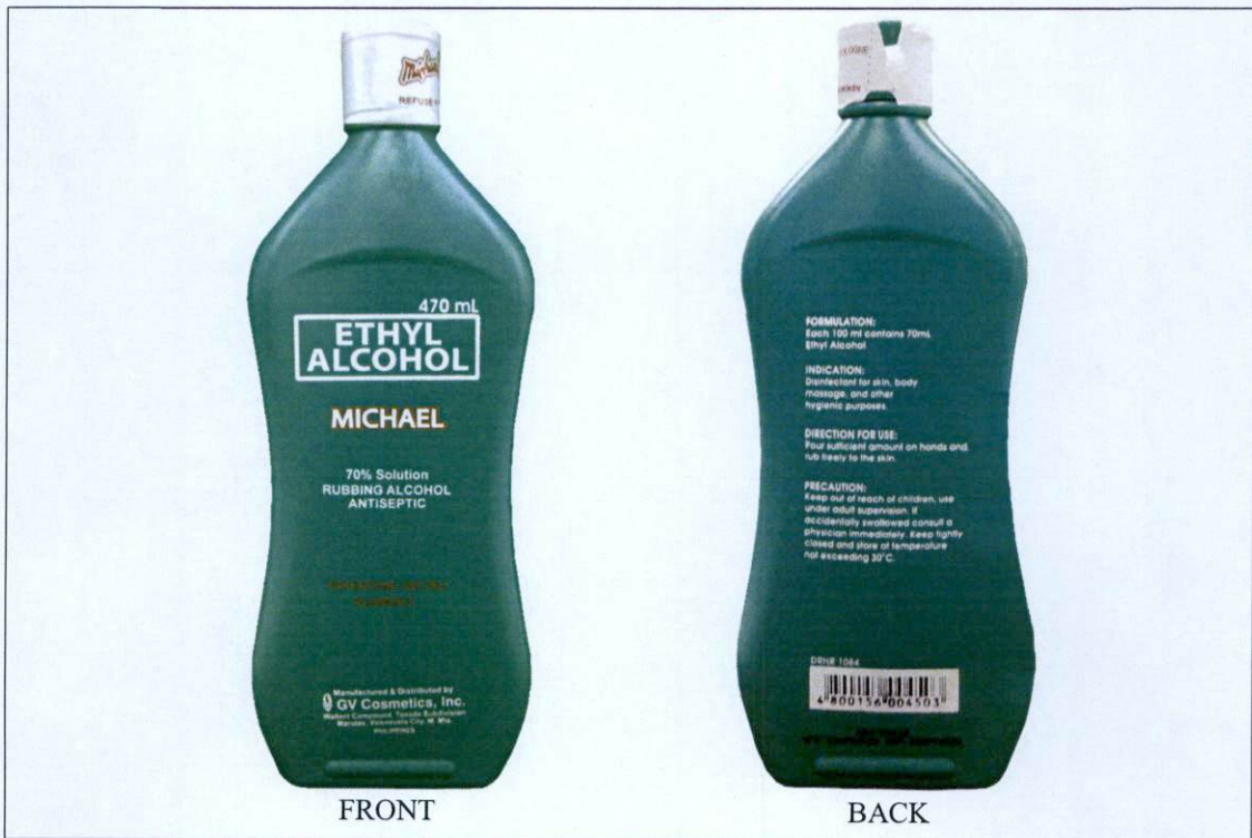
Figure 1. Ethyl Alcohol 70% Solution (Michael) for recall