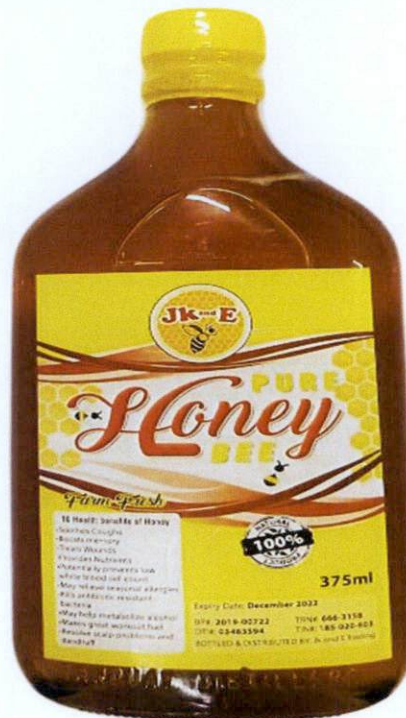
Figure 1. Unregistered JK AND E Pure Honey Bee, Farm Fresh, 375ml

The Food and Drug Administration (FDA) warns the public from purchasing and consuming the following unregistered food products and food supplements: