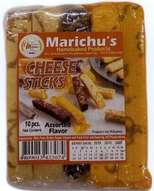
Figure 5. MARICHU'S Homebaked Products Cheese Sticks, Assorted Flavors, 10pcs