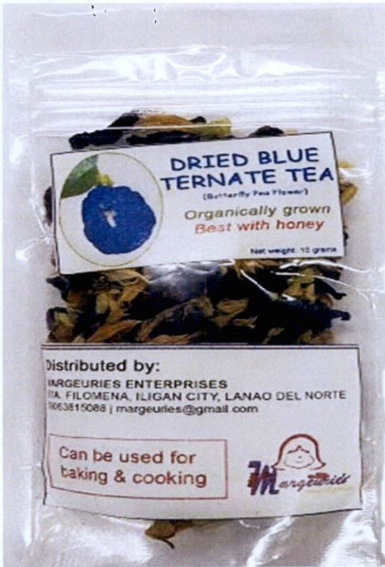
Figure 2. Unregistered MARGEURIES HOUSE OF GOODIES Dried Blue Ternate Tea (Butterfly Pea Flower)