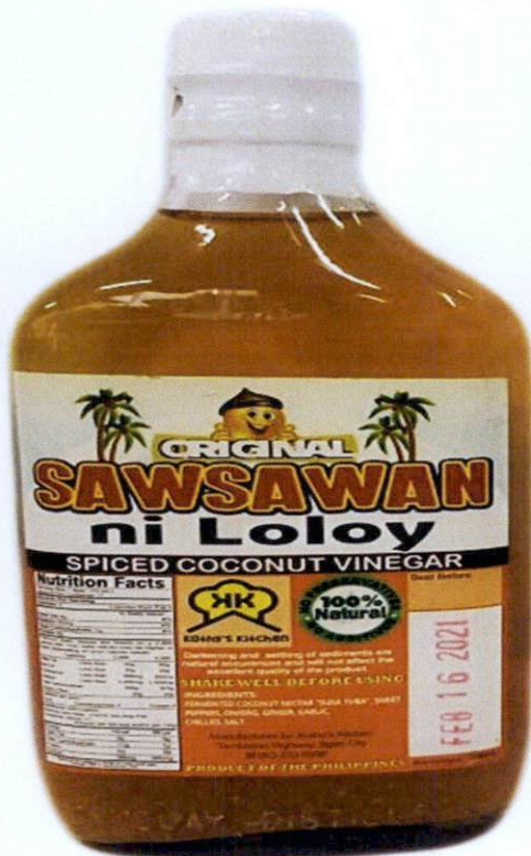
Figure 4. ORIGINAL SAWसान NI LOLOY Spiced Coconut Vinegar, 250ml