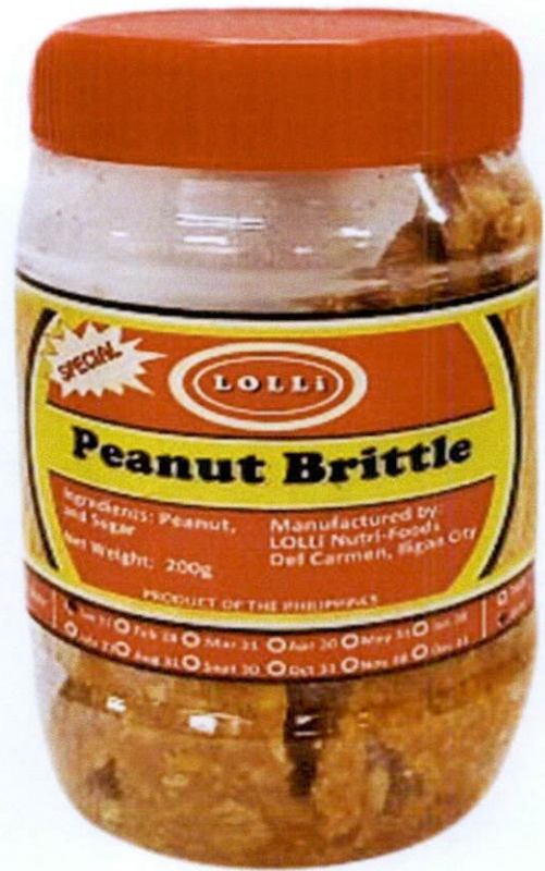
Figure 3. LOLLI Special Peanut Brittle, 200g