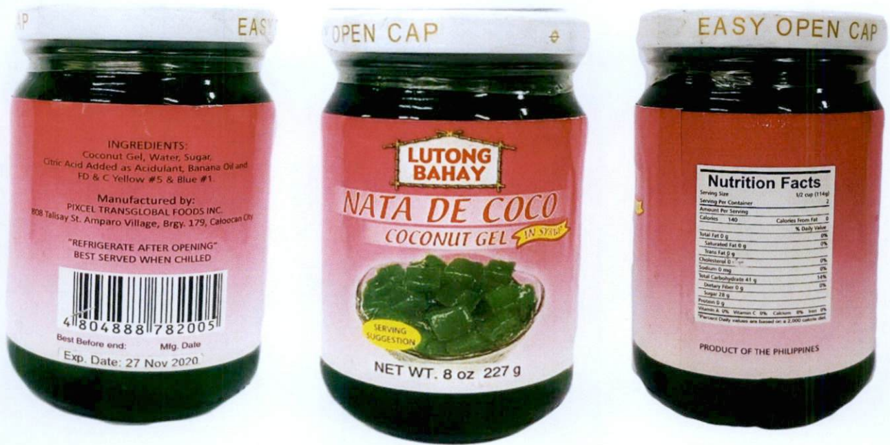
Figure 2. Unregistered LUTONG BAHAY Nata de Coco (Coconut Gel in Syrup), 8oz, 227g