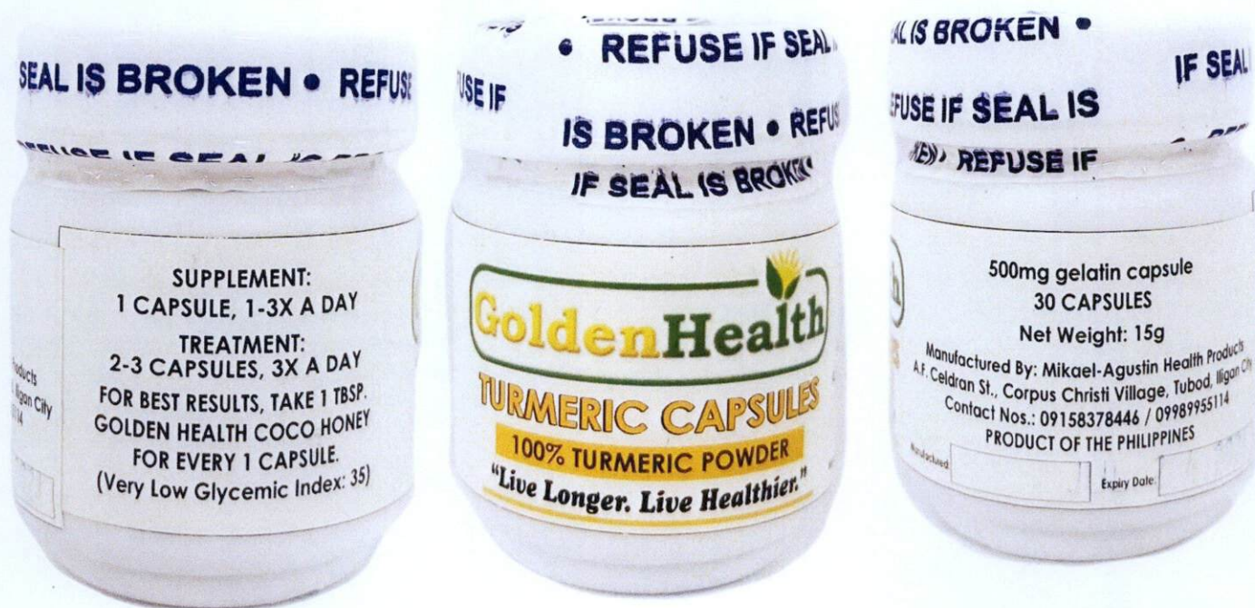
Figure 5. Unregistered GOLDEN HEALTH Turmeric Capsules, 100% Turmeric Powder, 500mg Gelatin Capsules