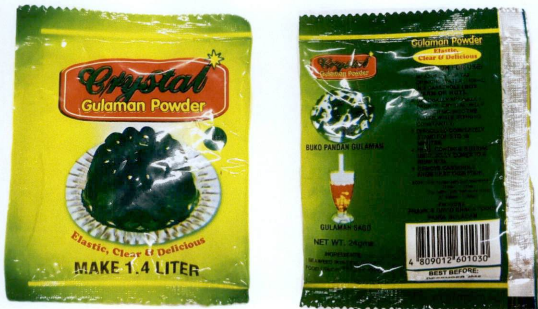
Figure 3. Unregistered CRYSTAL Gulaman Powder, Elastic, Clear and Delicious, Green, 24g