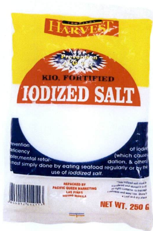
Figure 4. Unregistered TROPICAL HARVEST Kio, Fortified Iodized Salt, 250g