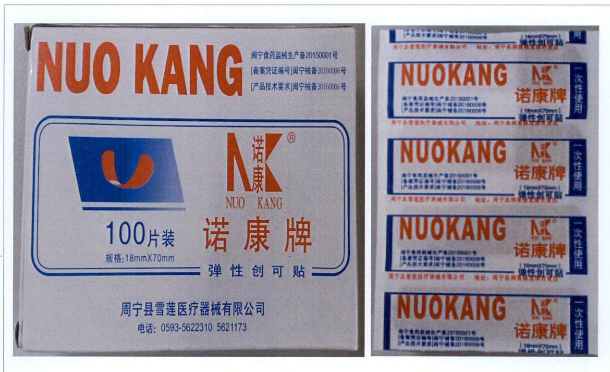
Figure 1. Unnotified Nuo Kang Adhesive Bandages

The Food and Drug Administration (FDA) warns all healthcare professionals and the general public NOT TO PURCHASE AND USE the unnotified medical device products: