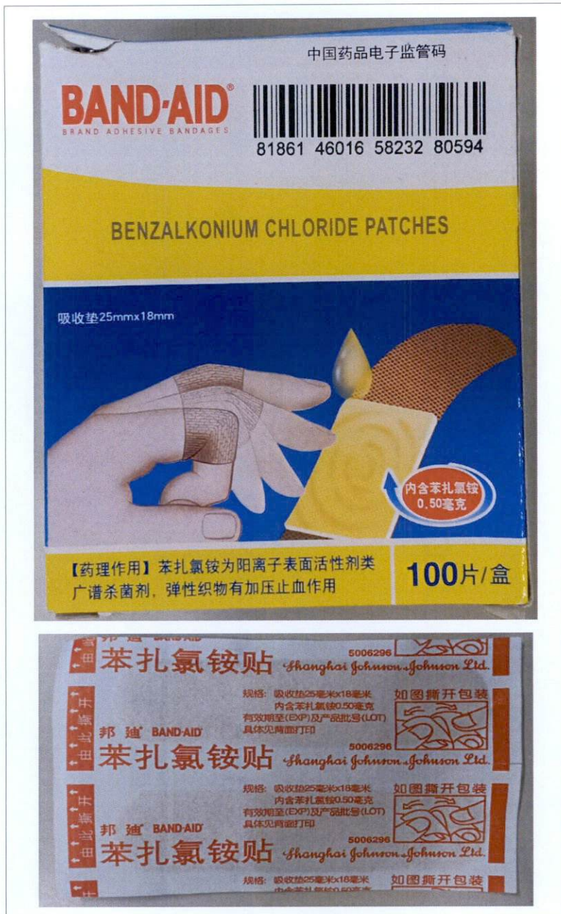
Figure 2. Unnotified Band-Aid Brand Adhesive Bandages Benzalkonium Chloride Patches

The FDA verified through post-marketing surveillance that the abovementioned medical device products are not notified and no corresponding Certificate of Medical Device Notification has been issued. Pursuant to the Republic Act No. 9711, otherwise known as the “Food and Drug Administration Act of 2009”, the manufacture, importation, exportation, sale, offering for sale, distribution, transfer, non-consumer use, promotion, advertising or sponsorship of health products without the proper authorization is prohibited.