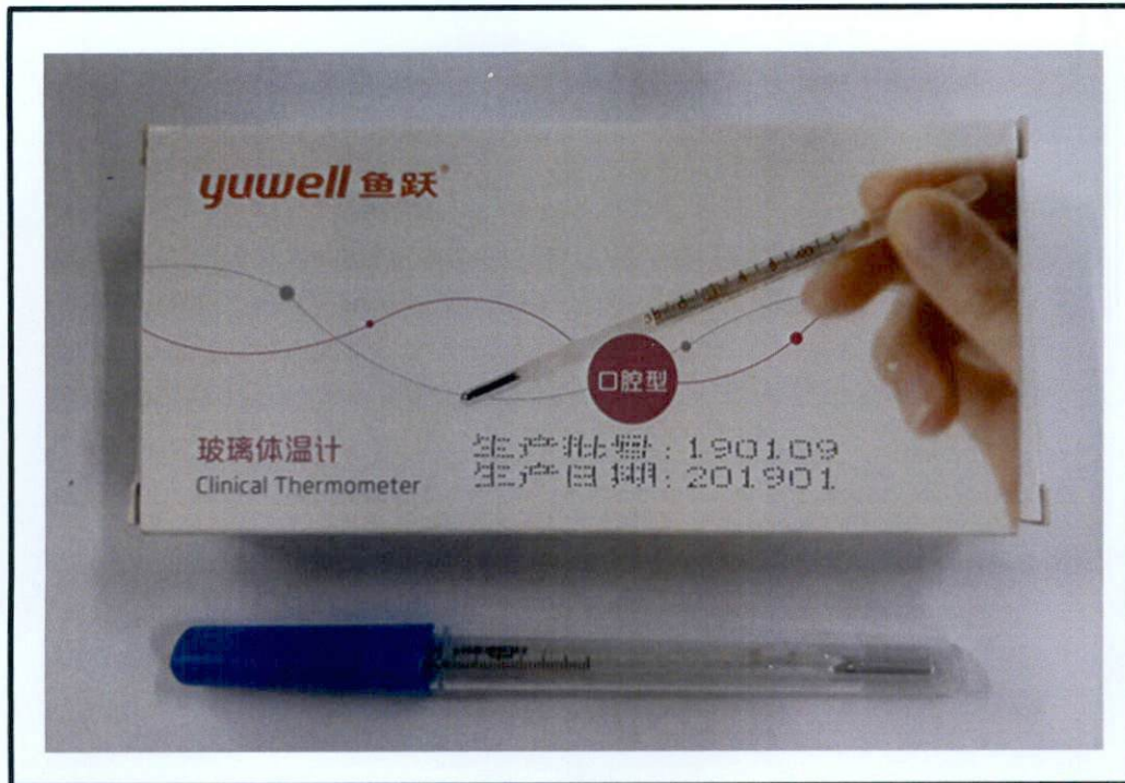
Figure 2. Unregistered Yuwell Clinical Thermometer

The FDA verified through post-marketing surveillance that the abovementioned medical device products are not registered and no corresponding Certificate of Medical Device Registration (CMDR) has been issued. Pursuant to the Republic Act No. 9711, otherwise known as the “Food and Drug Administration Act of 2009”, the manufacture, importation, exportation, sale, offering for sale, distribution, transfer, non-consumer use, promotion, advertising or sponsorship of health products without the proper authorization is prohibited.