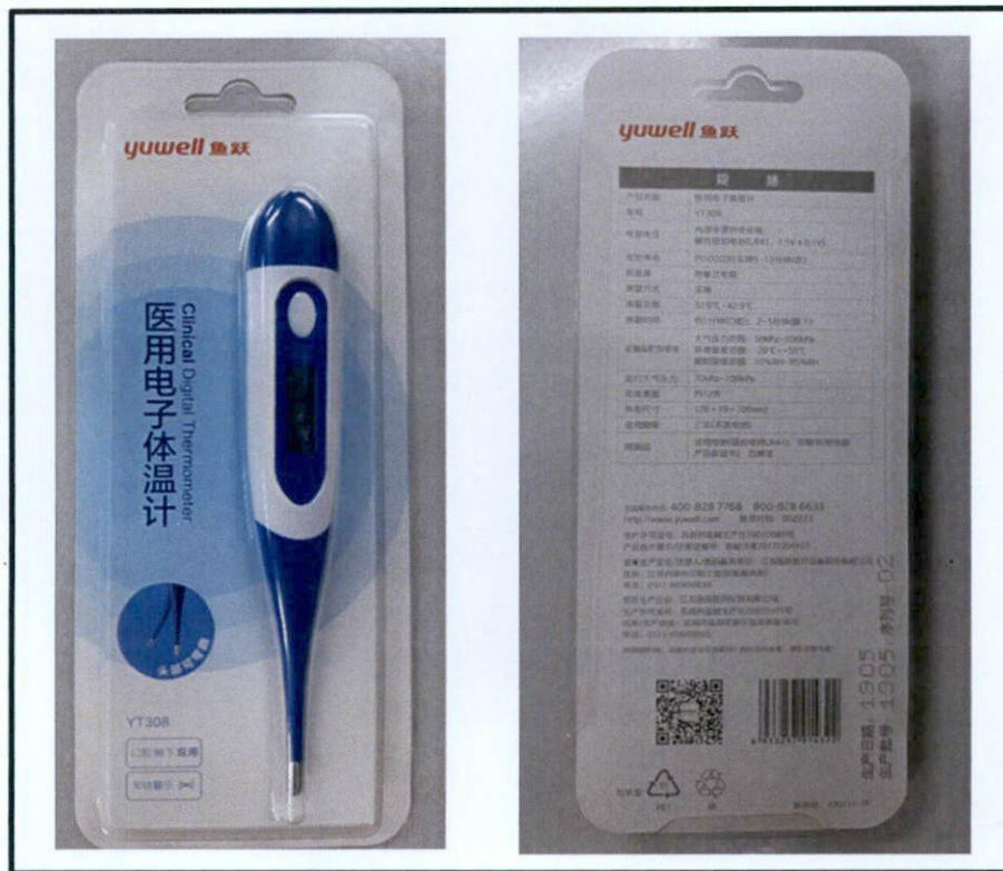
Figure 1. Unregistered Yuwell Clinical Digital Thermometer (YT308)

The Food and Drug Administration (FDA) warns all healthcare professionals and the general public NOT TO PURCHASE AND USE the unregistered medical device products: