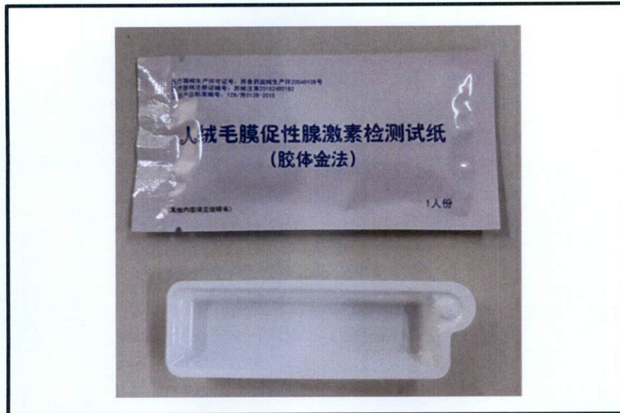
Figure 2. Unregistered “Pregnancy Test Kit in Foreign Markings”

The FDA verified through post-marketing surveillance that the abovementioned medical device product is not registered and no corresponding Certificate of Product Registration (CPR) has been issued. Pursuant to the Republic Act No. 9711, otherwise known as the “Food and Drug Administration Act of 2009”, the manufacture, importation, exportation, sale, offering for sale, distribution, transfer, non-consumer use, promotion, advertising or sponsorship of health products without the proper authorization is prohibited.