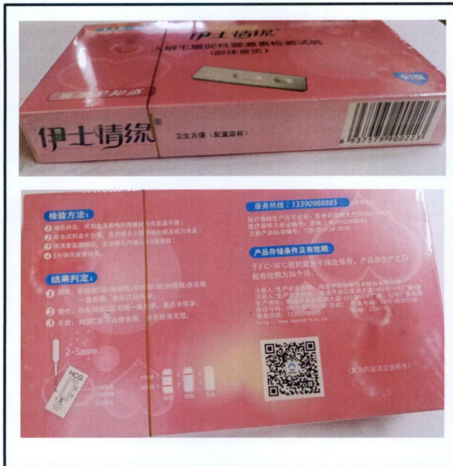
Figure 1. Unregistered "Pregnancy Test Kit in Foreign Markings"

The Food and Drug Administration (FDA) warns all healthcare professionals and the general public NOT TO PURCHASE AND USE the unregistered medical device product: