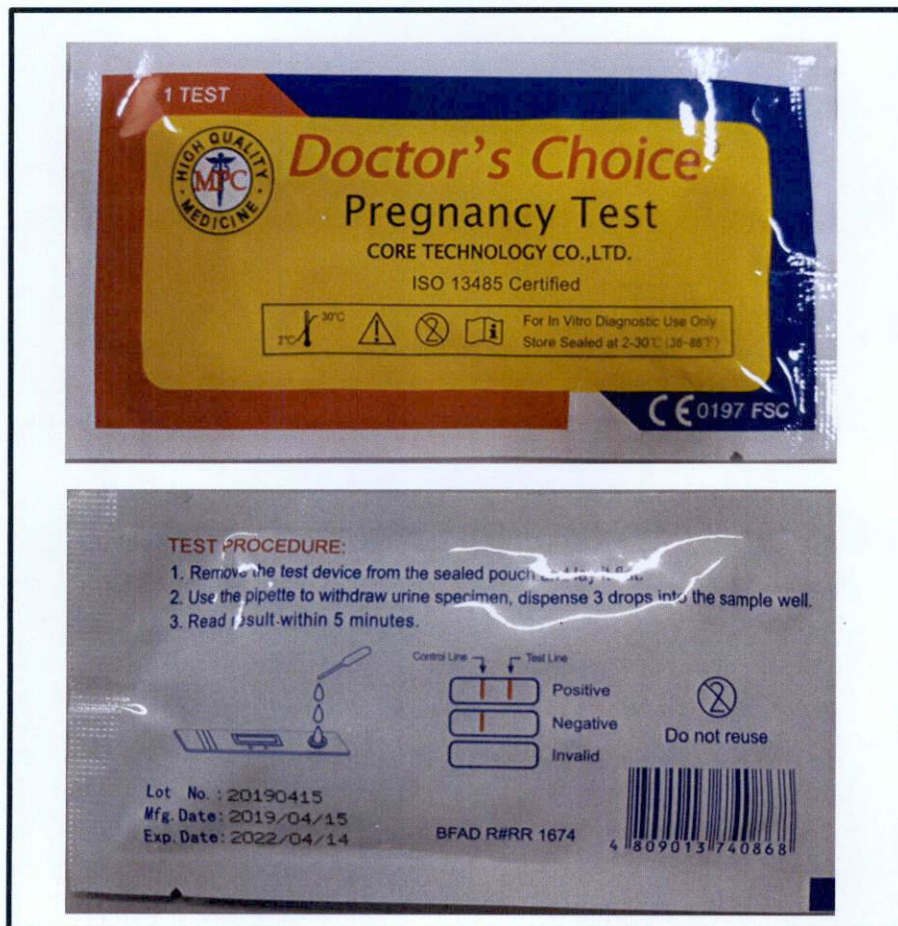
Figure 1. Unregistered “Doctor’s Choice® Pregnancy Test”

The Food and Drug Administration (FDA) warns all healthcare professionals and the general public NOT TO PURCHASE AND USE the unregistered medical device product: