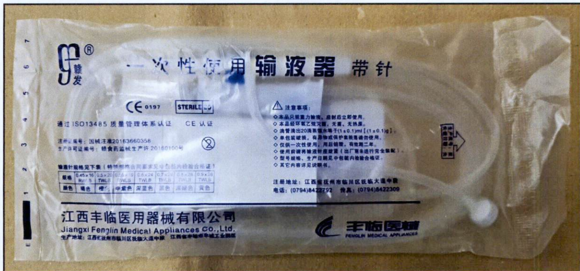
Figure 1. Unregistered Infusion Set with needle in foreign text

The Food and Drug Administration (FDA) warns all healthcare professionals and the general public NOT TO PURCHASE AND USE the unregistered medical device product: