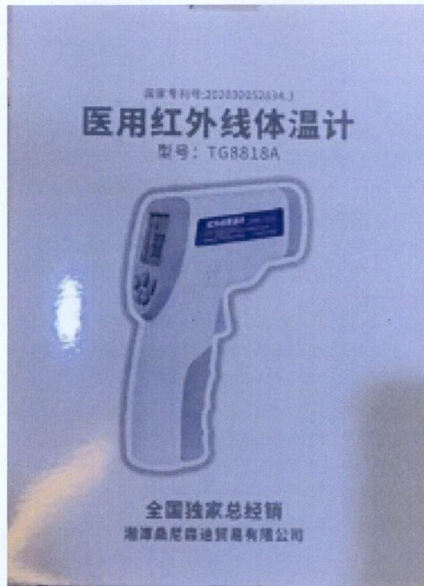
Figure 1. Unregistered Forehead Thermometer TG8818A in Foreign Characters

The Food and Drug Administration (FDA) warns all healthcare professionals and the general public NOT TO PURCHASE AND USE the unregistered medical device products: