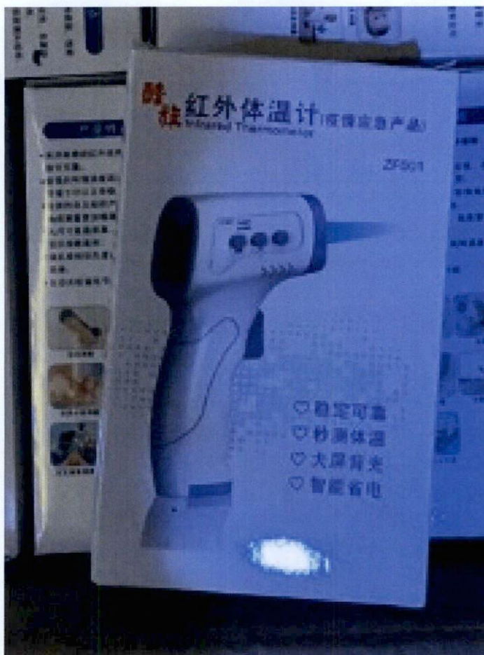
Figure 2. Unregistered Forehead Thermometer in Foreign Characters

The FDA verified through post-marketing surveillance that the above mentioned medical device products are not registered and no corresponding product registration certificate has been issued. Pursuant to the Republic Act No. 9711, otherwise known as the “Food and Drug Administration Act of 2009”, the manufacture, importation, exportation, sale, offering for sale, distribution, transfer, non-consumer use, promotion, advertising or sponsorship of health products without the proper authorization is prohibited.