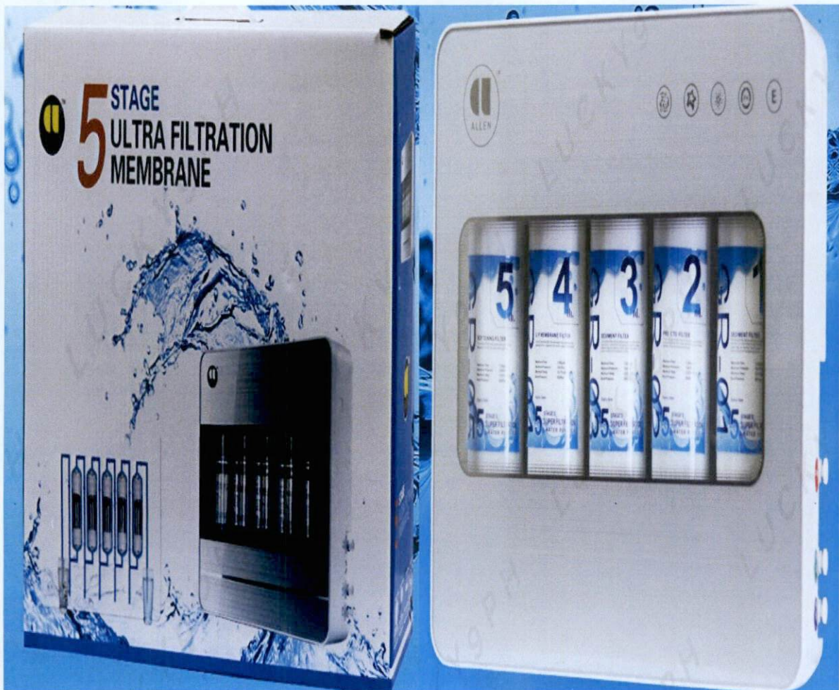
Figure 1. Unregistered Allen Water Purifier Filtration Membrane – 5 Stages Water Purification

The Food and Drug Administration (FDA) warns the general public NOT TO PURCHASE AND USE the unregistered health-related device product: