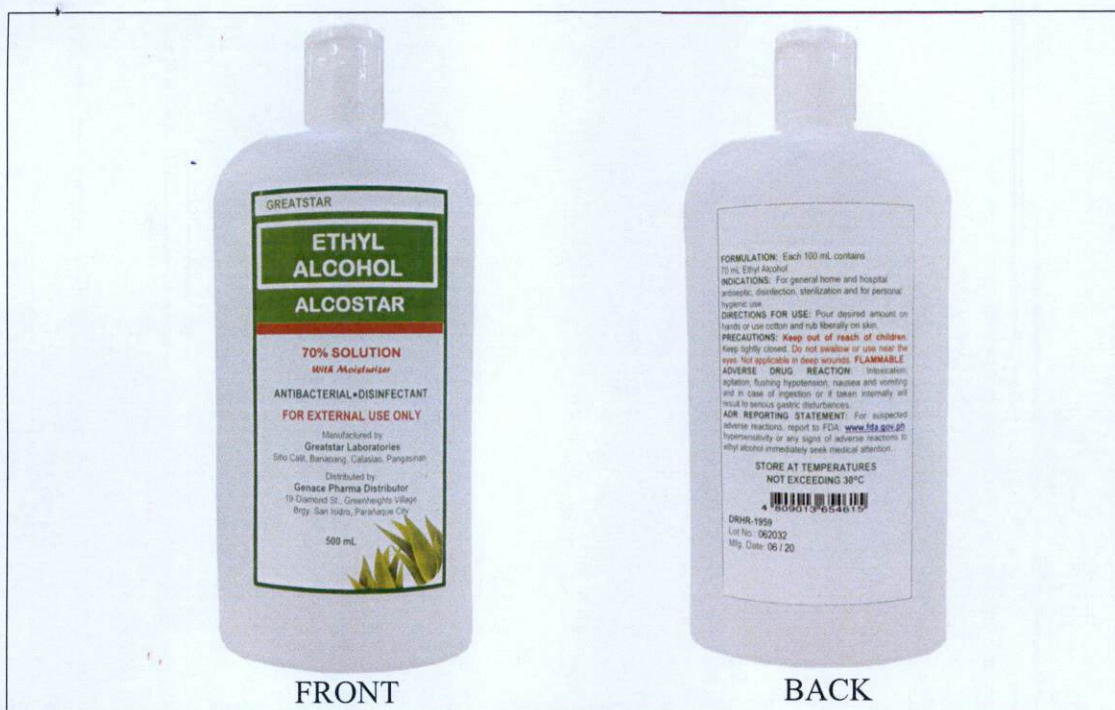
Figure 2. Lot No. 062032 of Ethyl Alcohol 70% Solution with Moisturizer (Alcostar) for recall

Based on the results of the laboratory analyses conducted by the FDA, it was found that the affected lots (052070 & 062032) do not contain Ethyl Alcohol, as labeled, but determined the presence of Methanol, 78.4% & 76.5% , respectively.