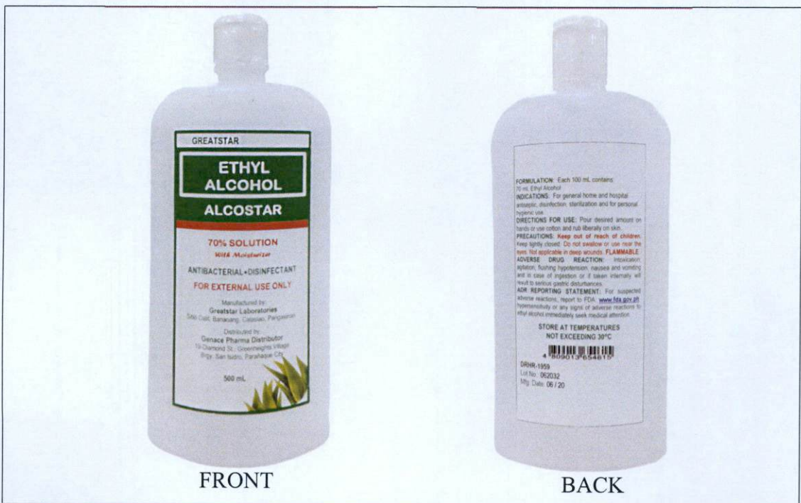
Figure 1. Lot No. 052070 of Ethyl Alcohol 70% Solution with Moisturizer (Alcostar) for recall