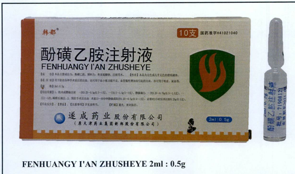
Figure 14. Unregistered drug product