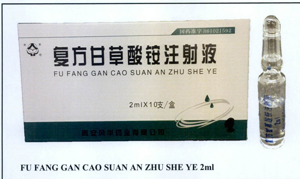
Figure 12. Unregistered drug product