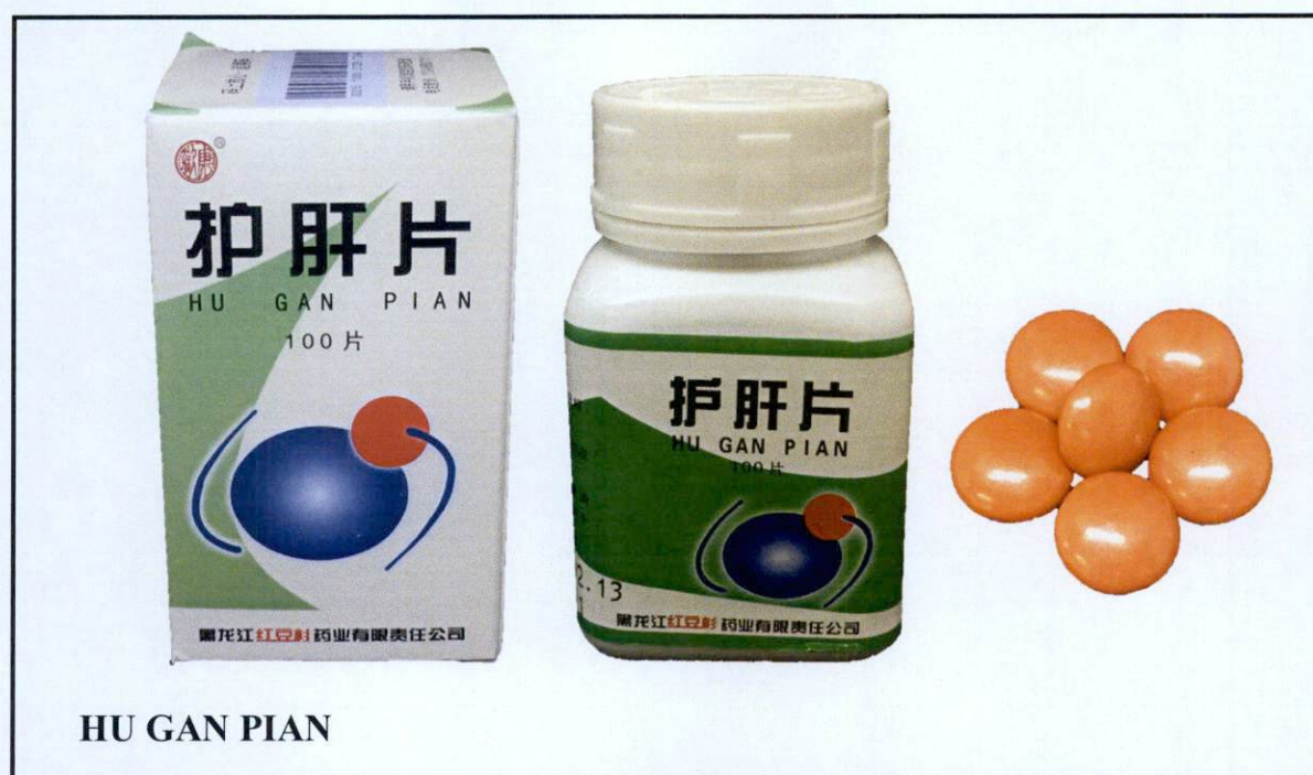
Figure 19. Unregistered drug product