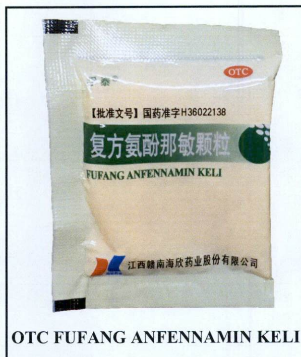
OTC FUFANG ANFENNAMIN KELI