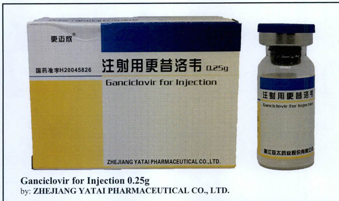
Figure 8. Unregistered drug product