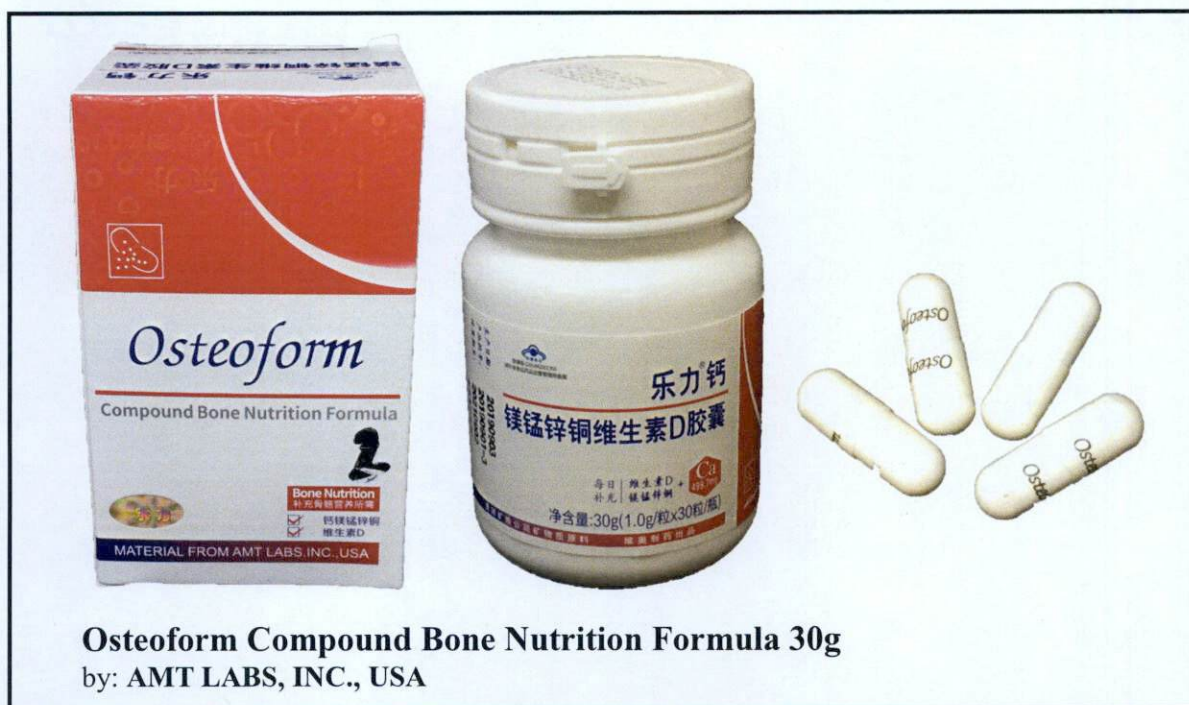
Figure 20. Unregistered drug product