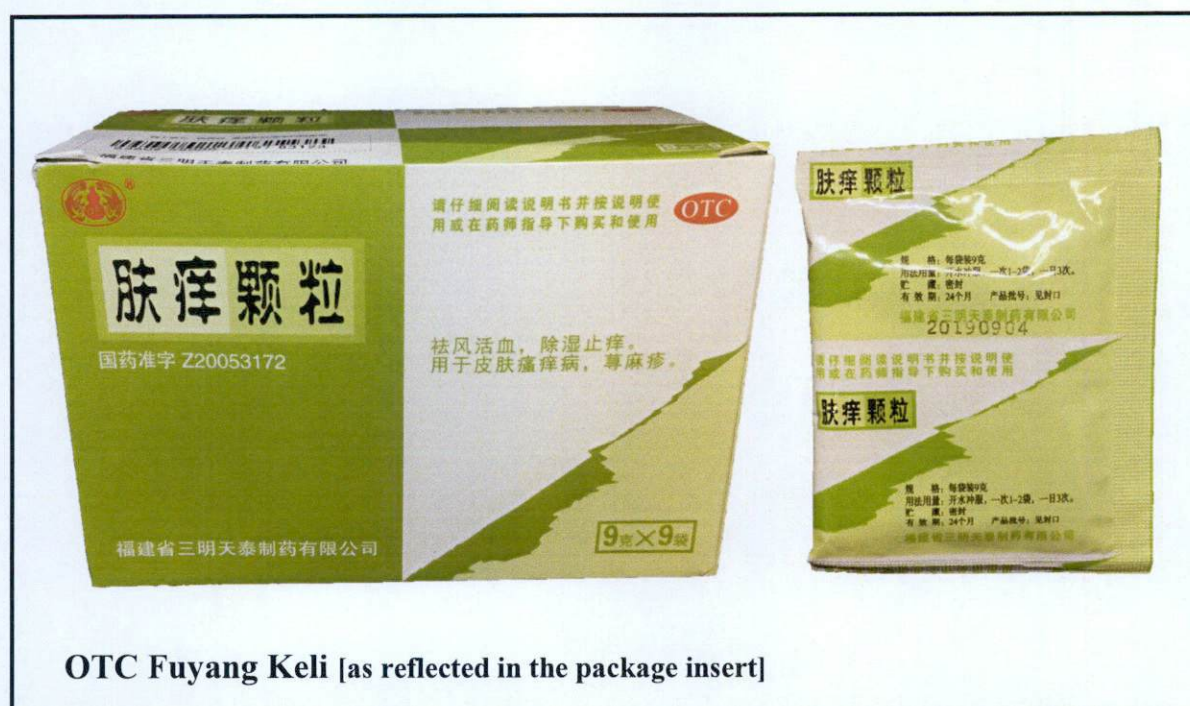
Figure 9. Unregistered drug product