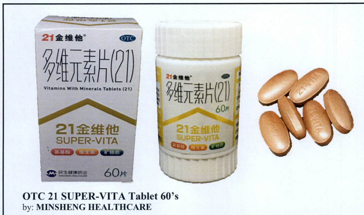
Figure 18. Unregistered drug product