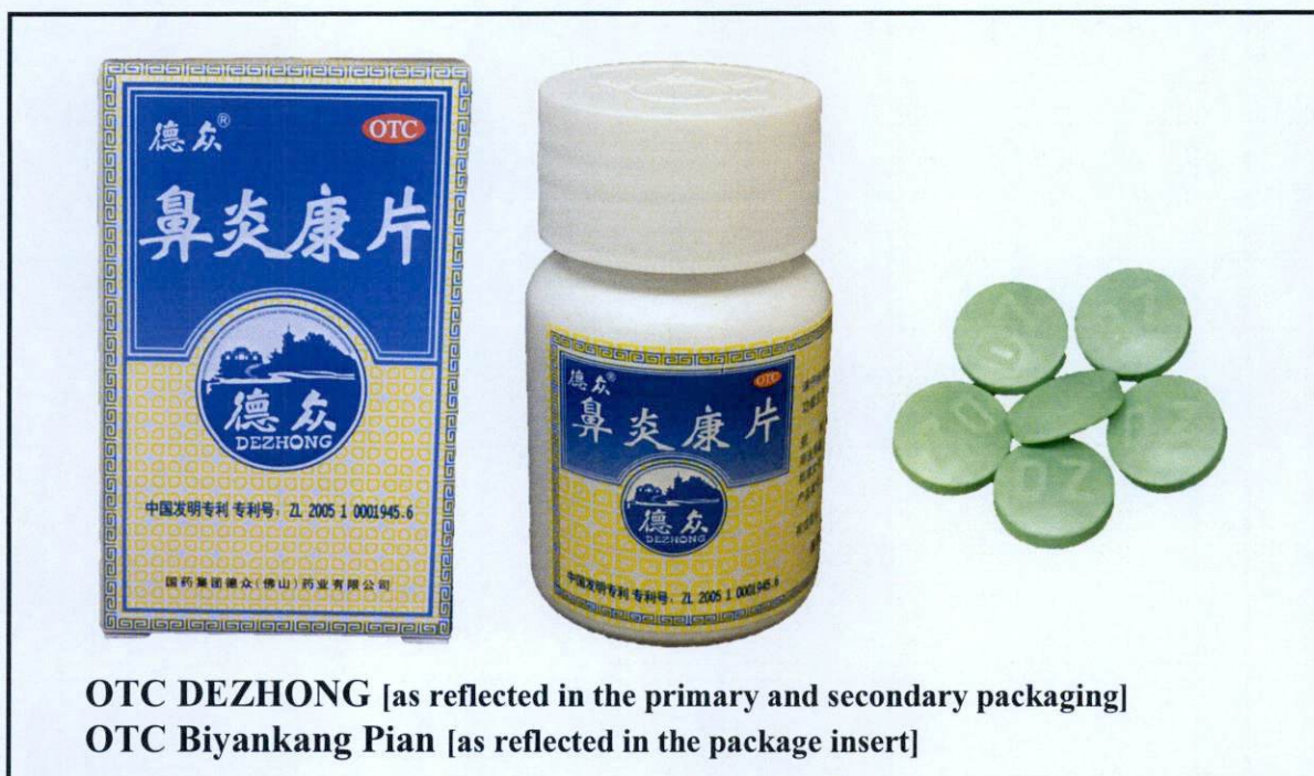
Figure 21. Unregistered drug product