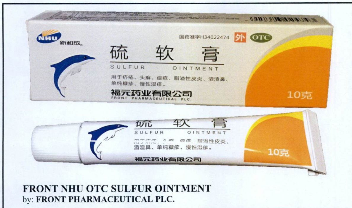
Figure 16. Unregistered drug product