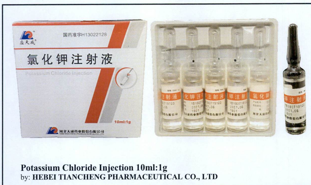
Figure 11. Unregistered drug product