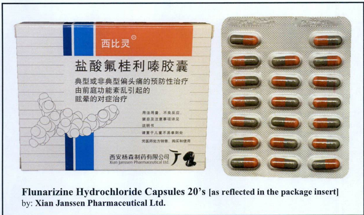
Figure 22. Unregistered drug product