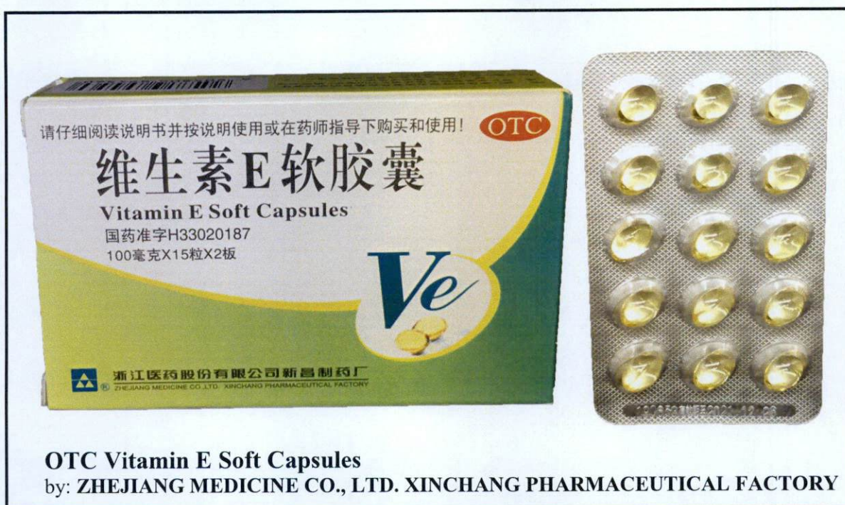
Figure 10. Unregistered drug product