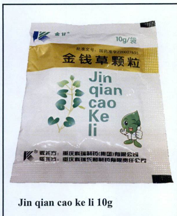
Jin qian cao ke li 10g