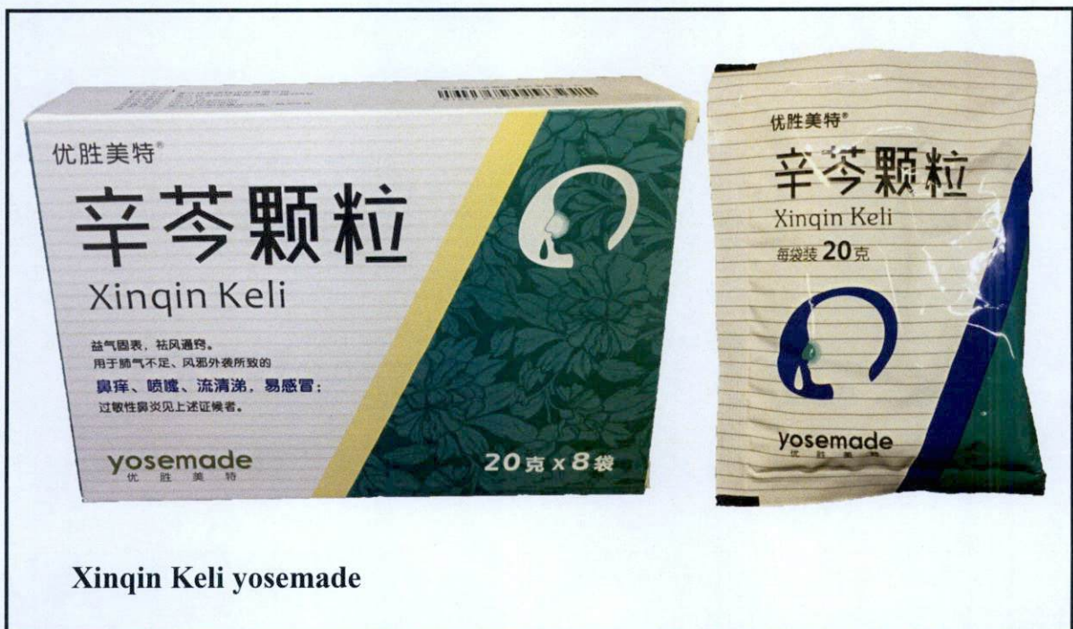
Figure 23. Unregistered drug product