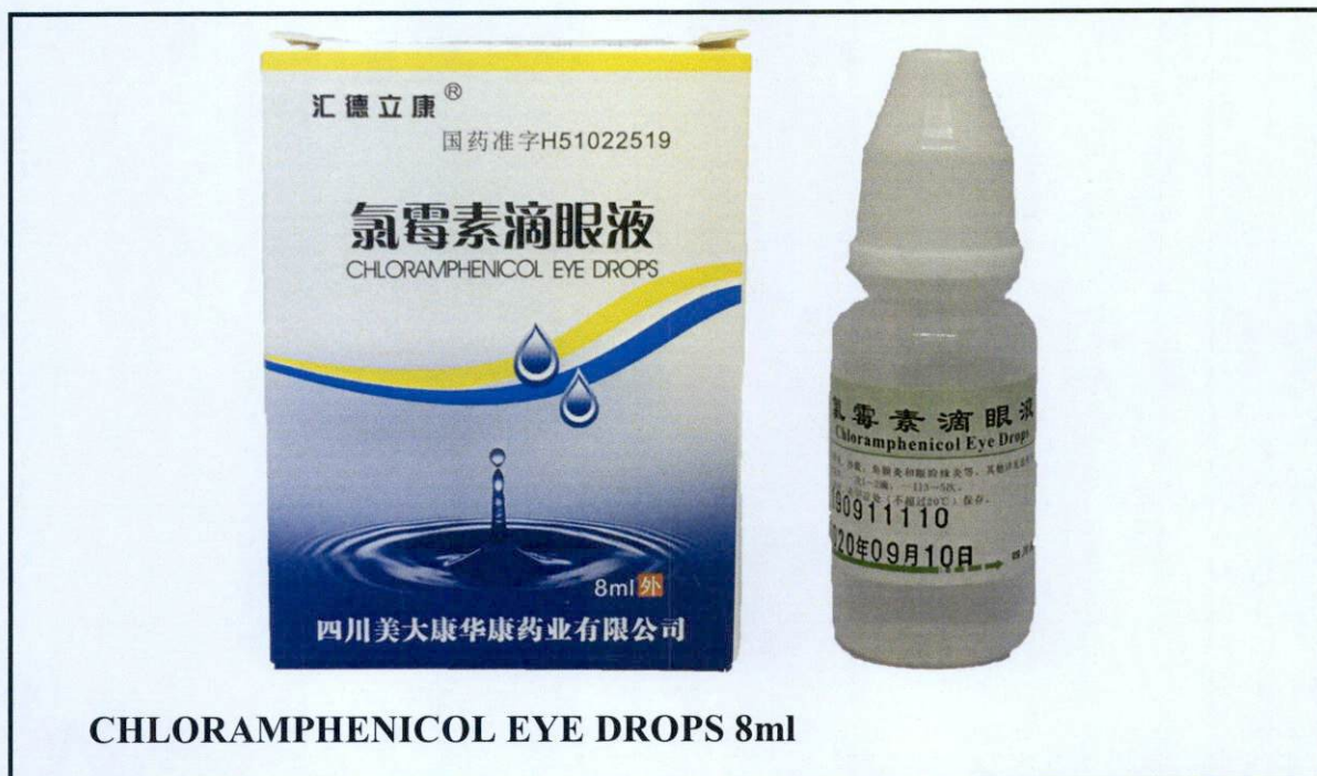
Figure 15. Unregistered drug product