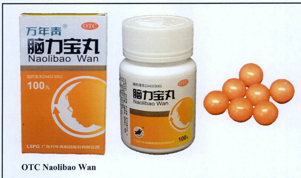
Figure 17. Unregistered drug product