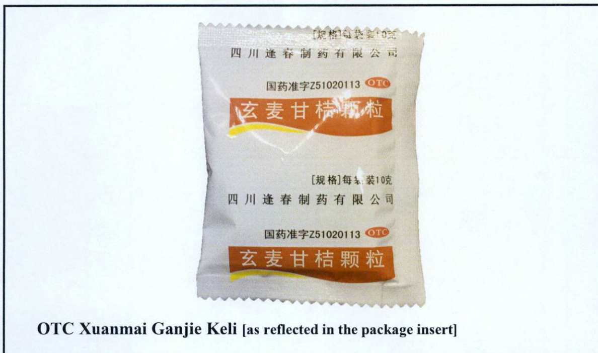
Figure 25. Unregistered drug product