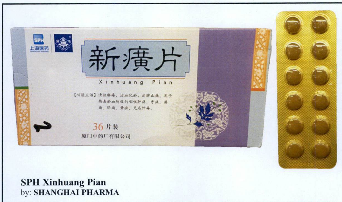
Figure 13. Unregistered drug product