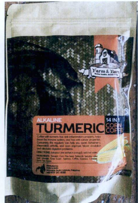
Figure 3. Unregistered FARM & BARN Alkaline 14 in 1 Corn Coffee Turmeric