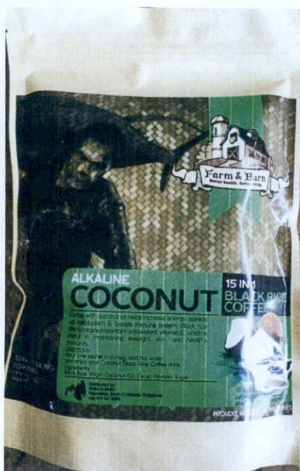
Figure 4. Unregistered FARM & BARN Alkaline 15 in 1 Black Rice Coffee Coconut