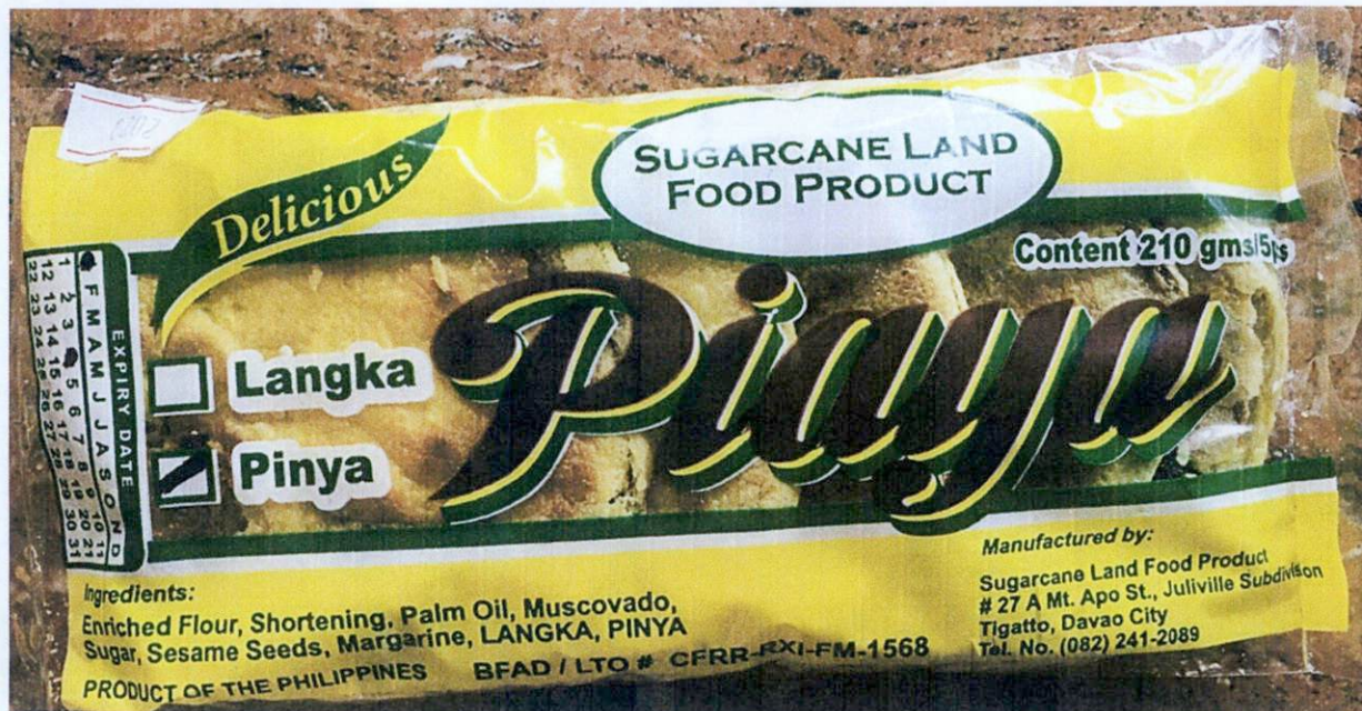
Figure 1. Unregistered SUGARCANE LAND FOOD PRODUCT Piaya (Pinya)

The Food and Drug Administration (FDA) warns the public from purchasing and consuming of the following unregistered food products: