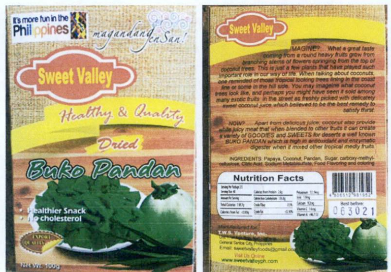
Figure 5. Unregistered SWEET VALLEY Healthy & Quality Dried Buko Pandan