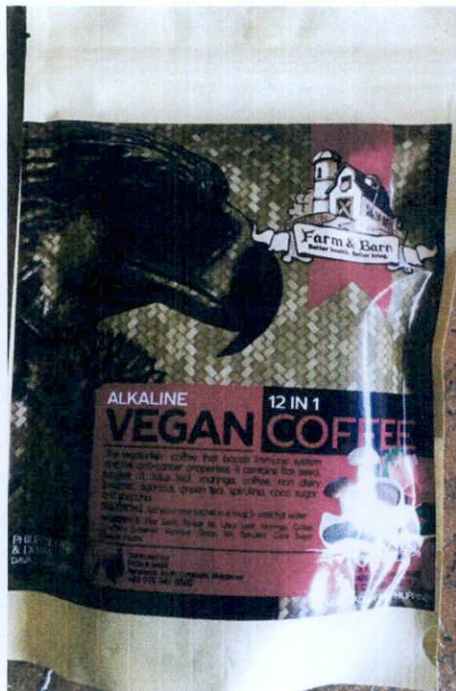
Figure 2. Unregistered FARM & BARN Alkaline 12 in 1 Vegan Coffee