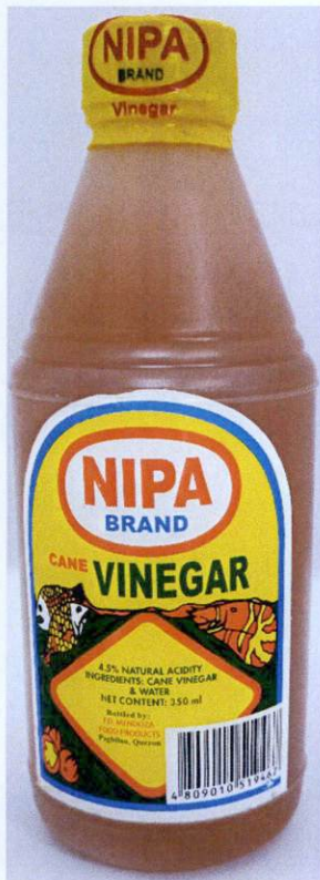
Figure 4. Unregistered NIPABRAND Cane Vinegar