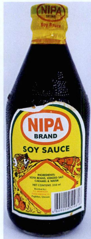
Figure 5. Unregistered NIPA BRAND Soy Sauce