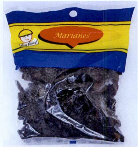
Figure 3. Unregistered MARIANES Dried Pasas