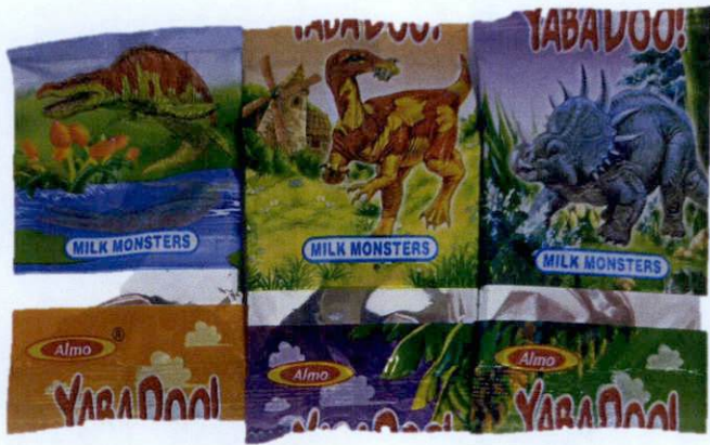
Figure 2. Unregistered ALMO Yabadoo Milk Monsters