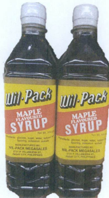
Figure 1. Unregistered WIL-PACK Maple Flavoured Syrup

The Food and Drug Administration (FDA) warns the public from purchasing and consuming of the following unregistered food products: