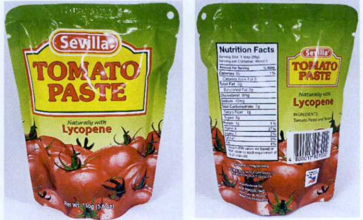
Figure 3. Unregistered SEVILLA Tomato Paste Naturally with Lycopene