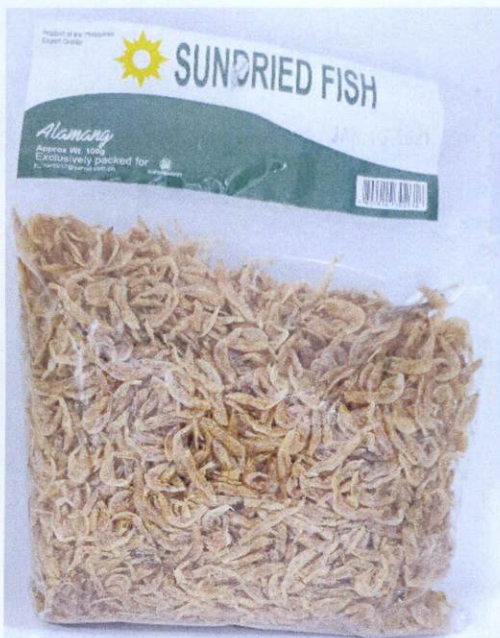
Figure 4. Unregistered SUNDRIED FISH Alamang