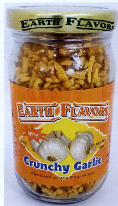
Figure 5. Unregistered EARTH FLAVORS Crunchy Garlic