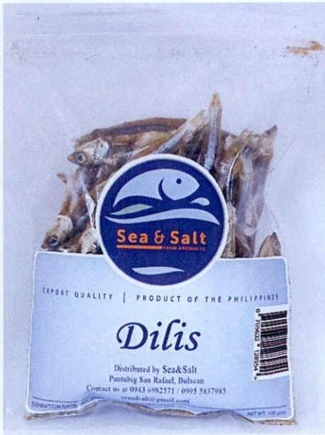
Figure 2. Unregistered SEA & SALT Dilis