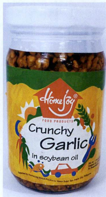
Figure 1. Unregistered HOMEJOY Crunchy Garlic in Soybean oil

The Food and Drug Administration (FDA) warns the public from purchasing and consuming of the following unregistered food products: