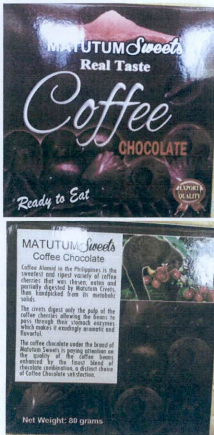
Figure 4. Unregistered MATUTUM SWEETS Ready to Eat Real Taste Coffee Chocolate