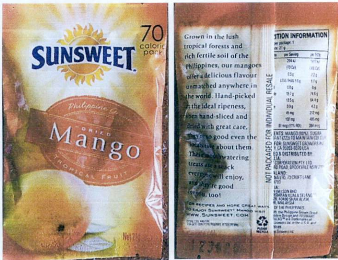
Figure 2. Unregistered SUNSWEET Dried Mango