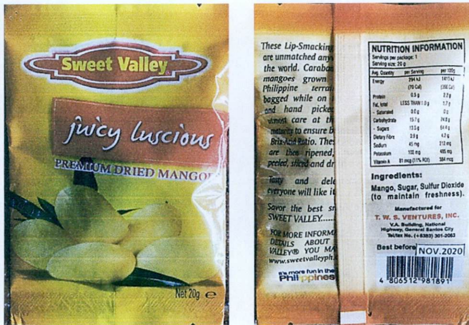
Figure 1. Unregistered SWEET VALLEY Juicy Luscious Premium Dried Mangoes

The Food and Drug Administration (FDA) warns the public from purchasing and consuming of the following unregistered food products: