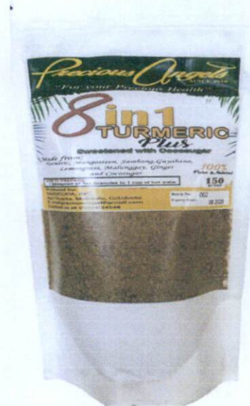
Figure 3. Unregistered PRECIOUS ANGELS 8 in 1 Turmeric Plus