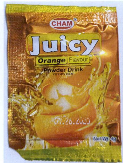
Figure 5. Unregistered CHAM JUICY Orange Flavour Powder Drink