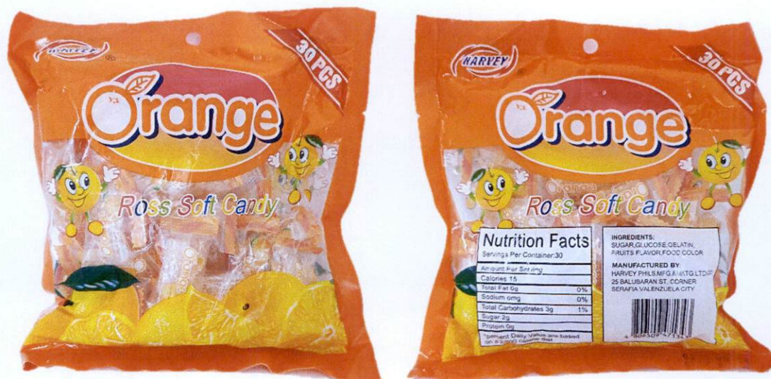
Figure 1. Unregistered HARVEY Orange Ross Soft Candy

The Food and Drug Administration (FDA) warns the public from purchasing and consuming the following unregistered food products: