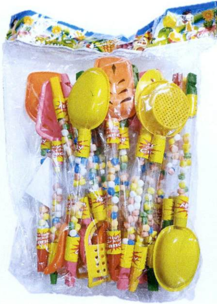
Figure 2. Unregistered UNBRANDED High Grade Candy