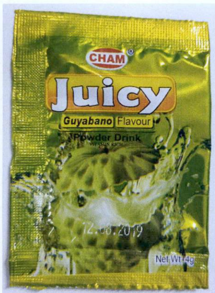
Figure 4. Unregistered CHAM JUICY Guyabano Flavour Powder Drink