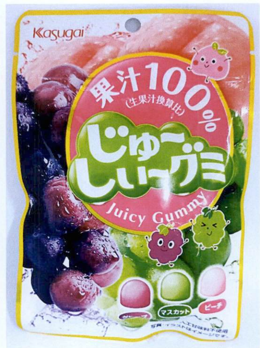
Figure 3. Unregistered KASUGAI Juicy Gummy