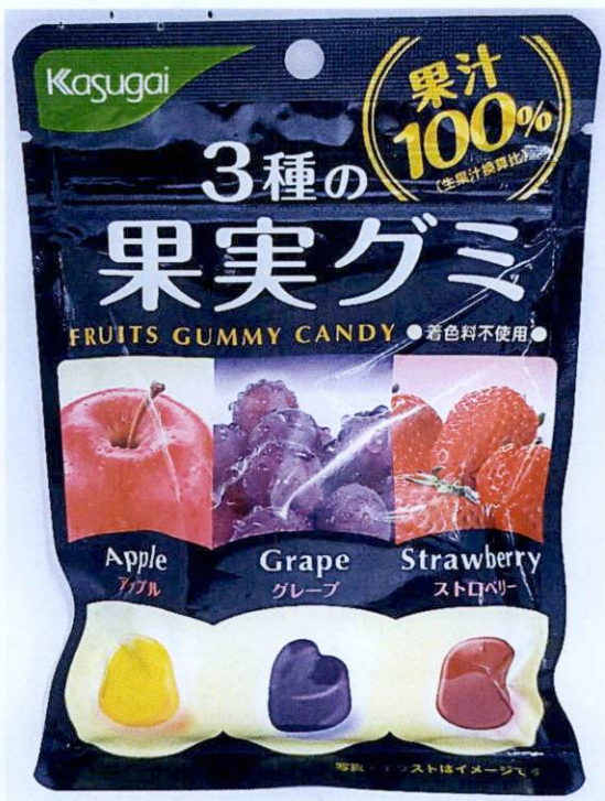
Figure 2. Unregistered KASUGAI Fruits Gummy Candy Apple, Grape, Strawberry