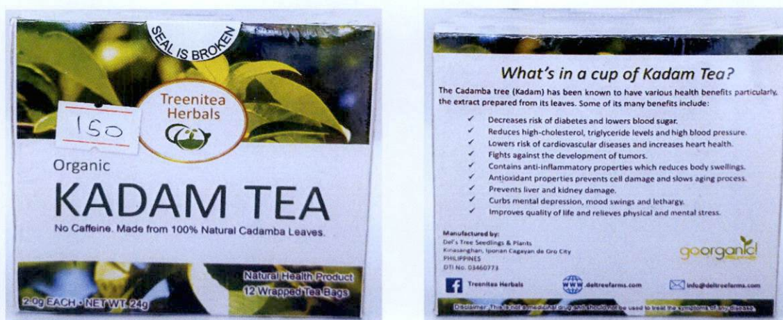
Figure 1. Unregistered TREENITEA HERBALS Organic Kadam Tea

The Food and Drug Administration (FDA) warns the public from purchasing and consuming the following unregistered food products: