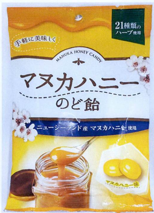
Figure 4. Unregistered SENJAKUAME Manuka Honey Candy