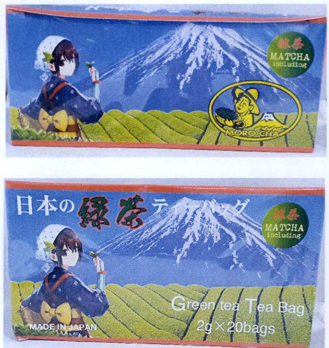
Figure 5. Unregistered MORO CHA Matcha Green Tea Bag