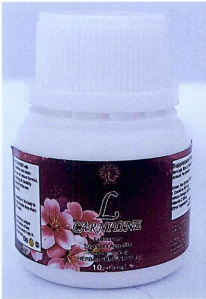
Figure 2. Unregistered L Carnitine Herbal Supplement