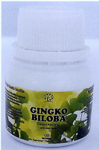
Figure 4. Unregistered Gingko Biloba Herbal Supplement