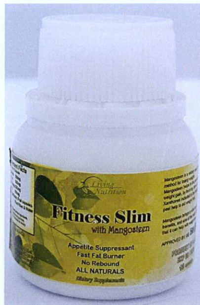
Figure 1. Unregistered LIVING NUTRITION Fitness Slim With Mangosteen All Naturals Dietary Supplements

The Food and Drug Administration (FDA) warns the public from purchasing and consuming the following unregistered food supplements: