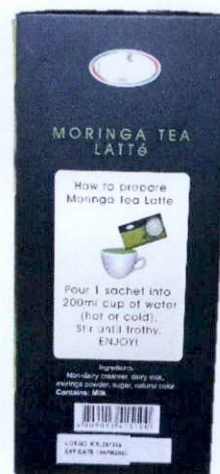
Figure 5. Unregistered MORINGA & MORE Moringa Tea Latte