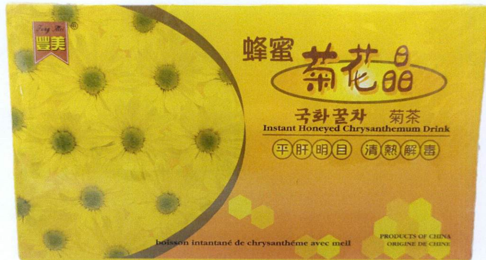
Figure 1. Unregistered FUNG MEI Instant Honeyed Chrysanthemum Drink

The Food and Drug Administration (FDA) warns the public from purchasing and consuming the following unregistered food products and food supplements: