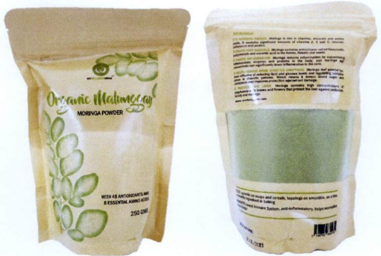
Figure 3. Unregistered MYWELLNESSIDEAS Organic Malunggay Moringa Powder