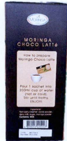
Figure 4. Unregistered MORINGA & MORE Moringa Choco Latte