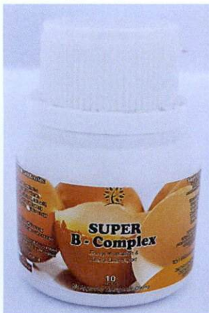
Figure 2. Unregistered Super B-Complex Food Supplement