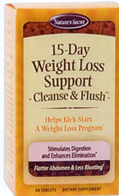
Figure 5. Unregistered NATURE'S SECRET 15 Day Weight Loss Support Cleanse & Flush Dietary Supplement