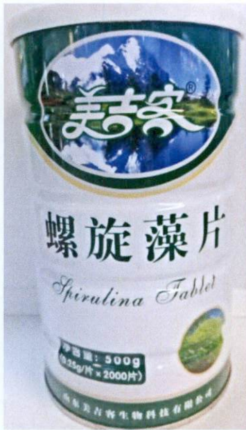
Figure 2. Unregistered Spirulina Tablets (Brand in Foreign Characters)