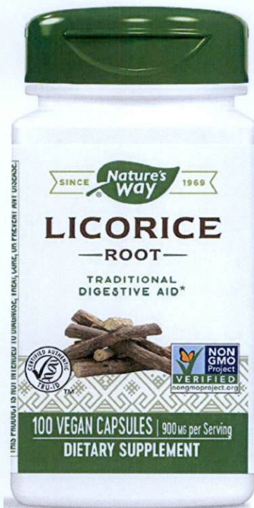
Figure 4. Unregistered NATURE'S WAY Licorice Root Traditional Digestive Aid Dietary Supplement