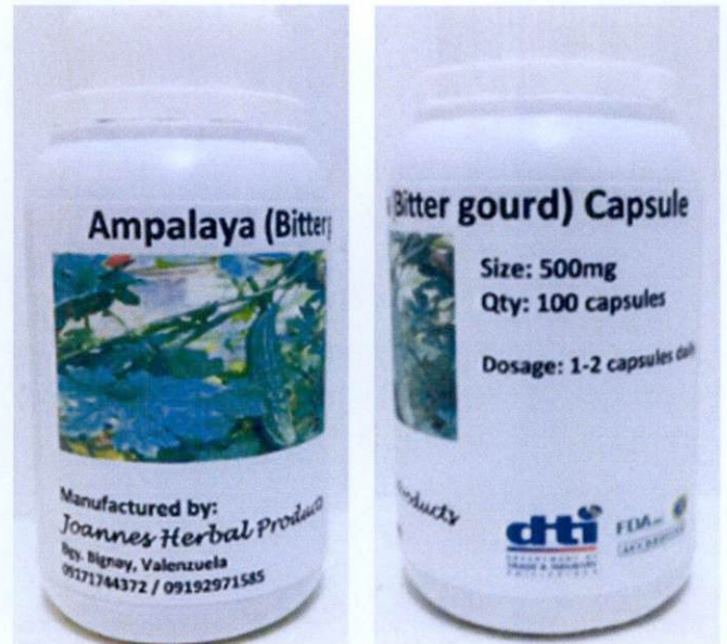
Figure 3. Unregistered Ampalaya (Bitter melon) Capsule