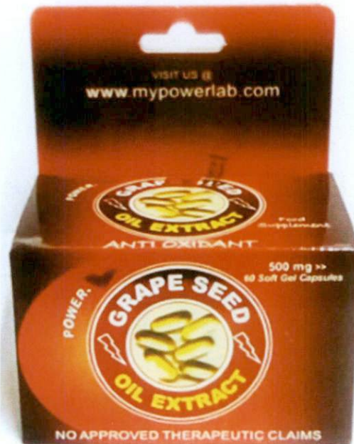
Figure 1. Unregistered POWER LAB Grape Seed Oil Extract

The Food and Drug Administration (FDA) warns the public from purchasing and consuming the following unregistered food supplements: