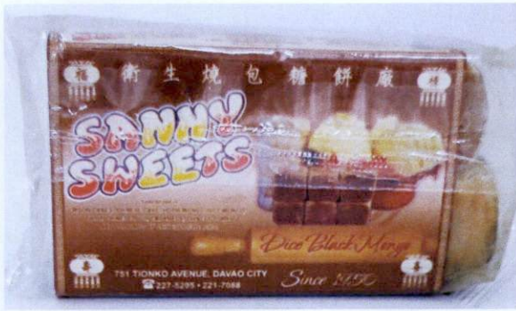
Figure 2. Unregistered SANNY SWEETS Dice Black Munggo