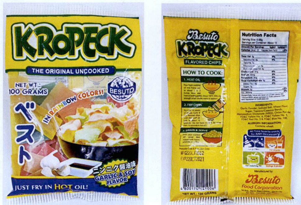
Figure 1. Unregistered BESUTO Kropeck in Rainbow Colors Garlic & Soy Flavor

The Food and Drug Administration (FDA) warns the public from purchasing and consuming of the following unregistered food products: