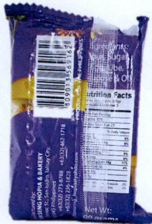
Figure 4. Unregistered TIAN SENG Hopia Dice Ube Mini