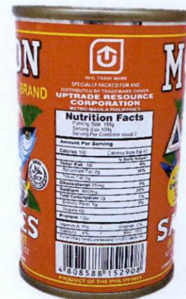
Figure 5. Unregistered MORJON Sardines in Tomato Sauce Hot