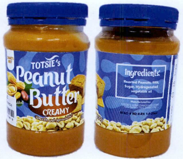
Figure 3. Unregistered TOTSIE'S Peanut Butter Creamy