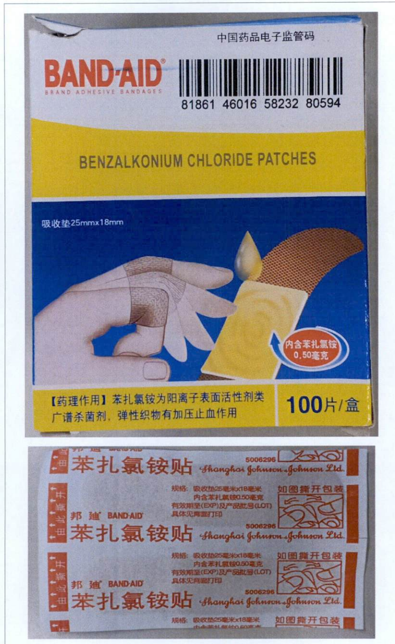
Figure 2. Unnotified Band-Aid Brand Adhesive Bandages Benzalkonium Chloride Patches

The FDA verified through post-marketing surveillance that the abovementioned medical device products are unnotified and no corresponding product notification certificate has been issued. Pursuant to the Republic Act No. 9711, otherwise known as the “Food and Drug Administration Act of 2009”, the manufacture, importation, exportation, sale, offering for sale, distribution, transfer, non-consumer use, promotion, advertising or sponsorship of health products without the proper authorization is prohibited.