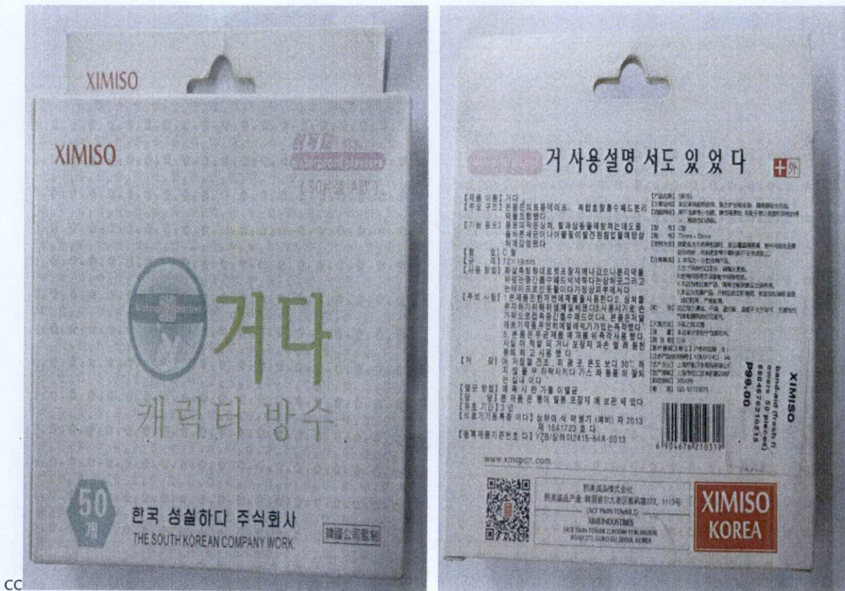
Figure 1. Unnotified Ximiso Waterproof Plasters

The Food and Drug Administration (FDA) warns all healthcare professionals and the general public NOT TO PURCHASE AND USE the unnotified medical device product: