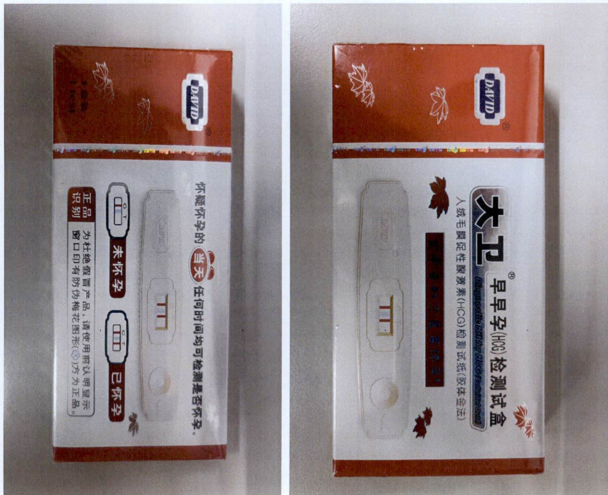
Figure 1. Unregistered David Diagnostic Kit of HCG (Colloidal Gold)

The Food and Drug Administration (FDA) warns all healthcare professionals and the general public NOT TO PURCHASE AND USE the unregistered medical device product: