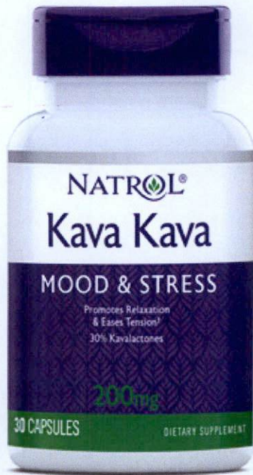
Figure 2. Unregistered NATROL Kava Kava Mood & Stress Dietary Supplement, 200mg 30 Capsules