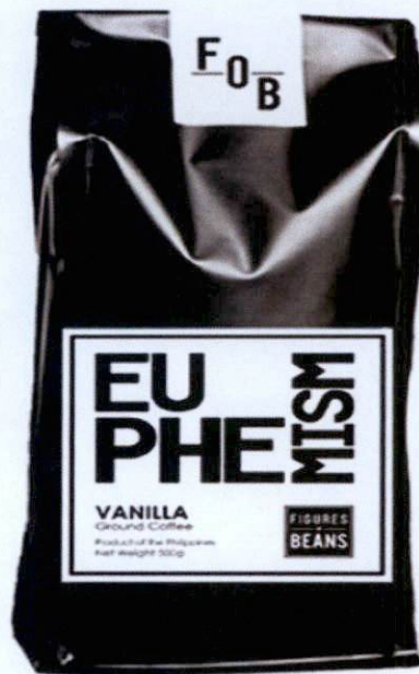
Figure 1. Unregistered FIGURES OF BEANS EUPHEMISM Vanilla Beans, 500 grams

The Food and Drug Administration (FDA) warns all healthcare professionals and the general public NOT TO PURCHASE AND CONSUME the following unregistered food product and food supplements: