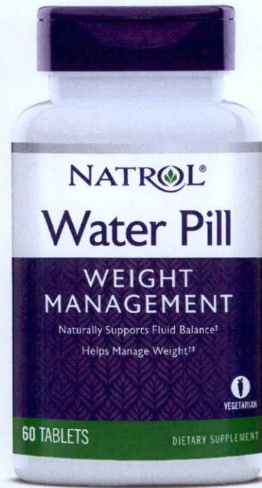
Figure 3. Unregistered NATROL Water Pill - Weight Management Dietary Supplement, 60 Tablets