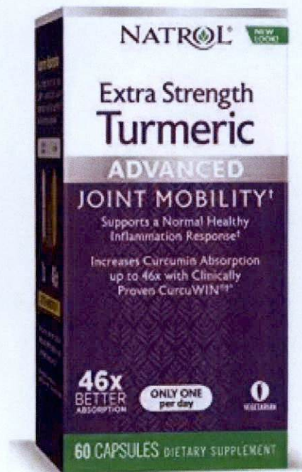
Figure 5. Unregistered NATROL Extra Strength Turmeric Advance Joint Mobility Dietary Supplement 60 Capsules