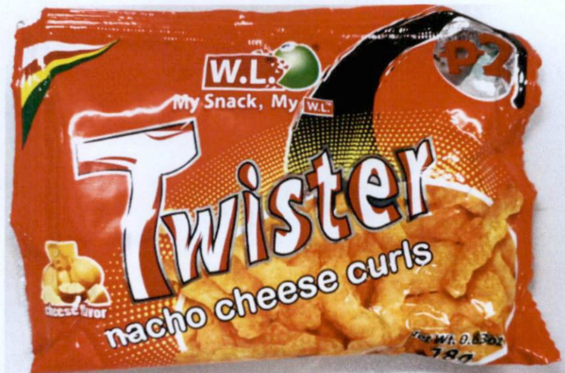
Figure 5. Unregistered W.L. MY SNACK MY W.L. Twister Nacho Cheese Curls – Cheese Flavor, Net Wt. 18g (0.63oz)