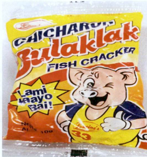
Figure 4. Unregistered LORAINE'S Chicharong Bulaklak Fish Cracker, Net Wt. 10g