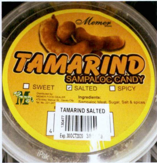
Figure 2. Unregistered MEMER Tamarind Sampaloc Candy- Salted