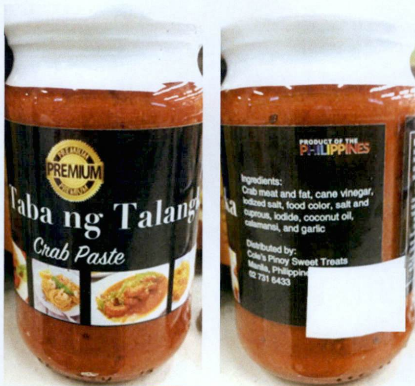
Figure 1. Unregistered PREMIUM Taba Ng Talangka Crab Paste

The Food and Drug Administration (FDA) warns all healthcare professionals and the general public NOT TO PURCHASE AND CONSUME the following unregistered food products: