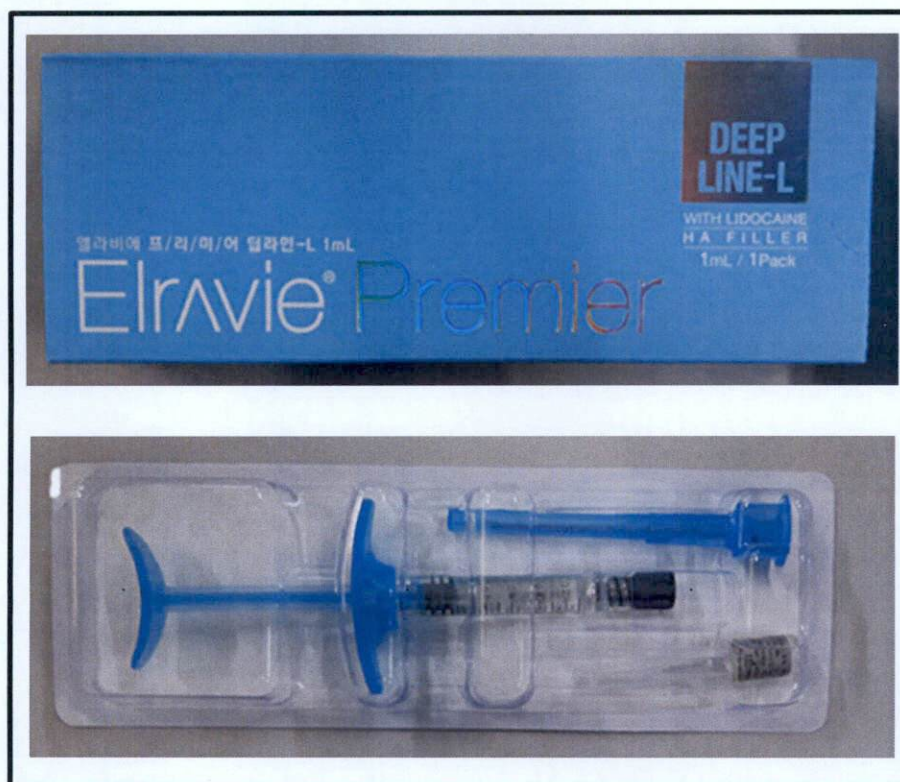
Figure 1. Unregistered “Elravie® Premier Deep Line-L With Lidocaine Syringe HA Filler, 1 ml / 1 pack”

The Food and Drug Administration (FDA) warns all healthcare professionals and the general public NOT TO PURCHASE AND USE the unregistered medical device product: