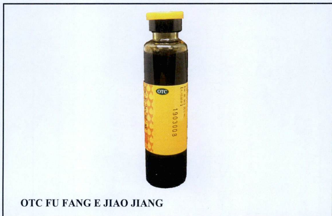
OTC FU FANG E JIAO JIANG