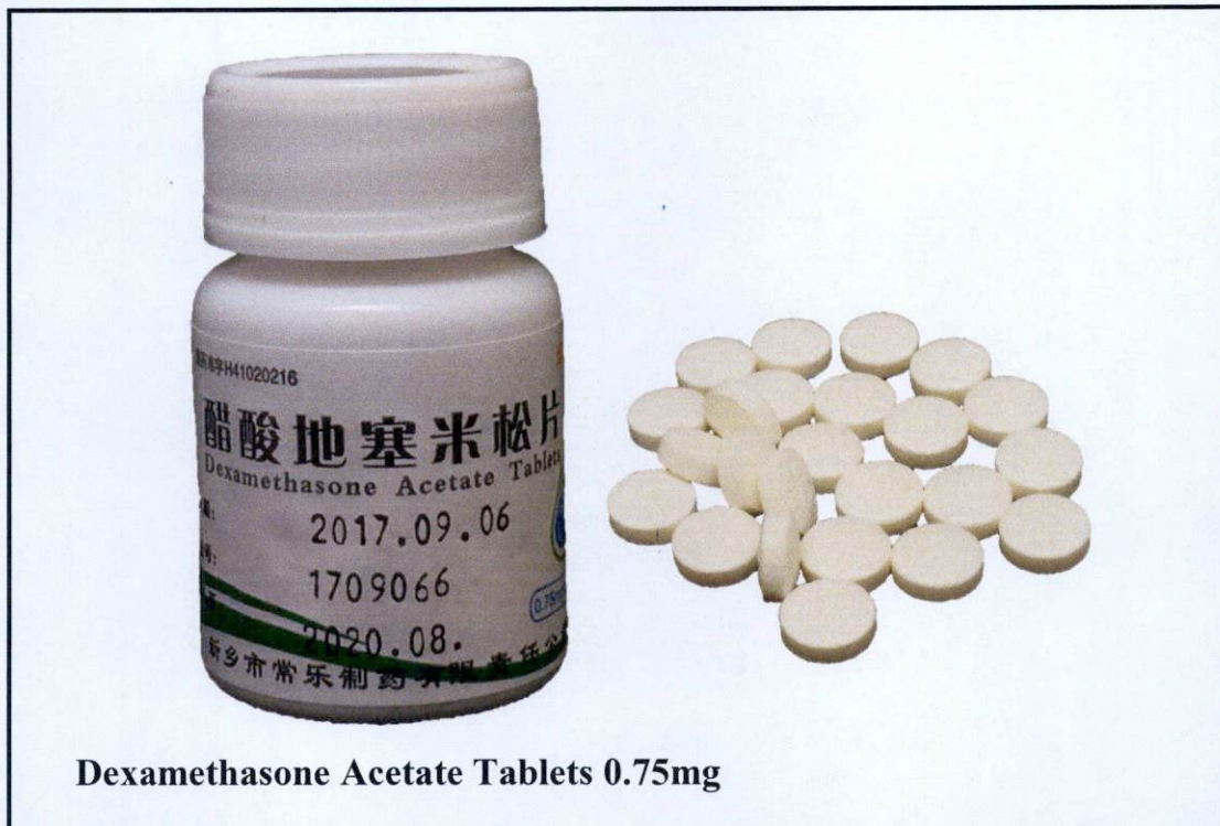
Dexamethasone Acetate Tablets 0.75mg