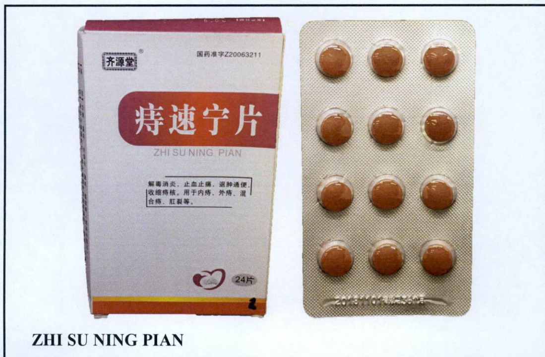
ZHI SU NING PIAN

The Food and Drug Administration (FDA) advises the public against the purchase and use of the following unregistered drug products: