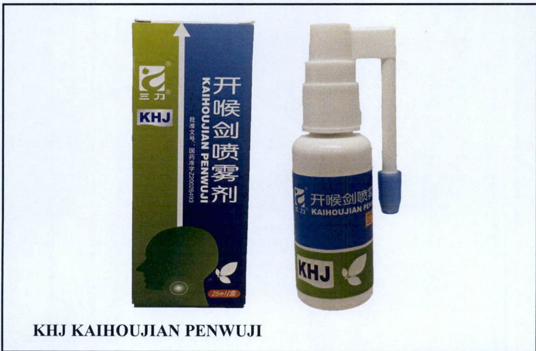
KHJ KAIHOUIJIAN PENWUJI