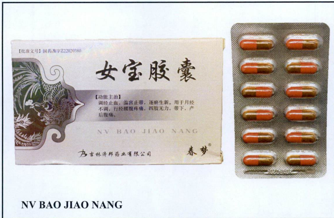
NV BAO JIAO NANG