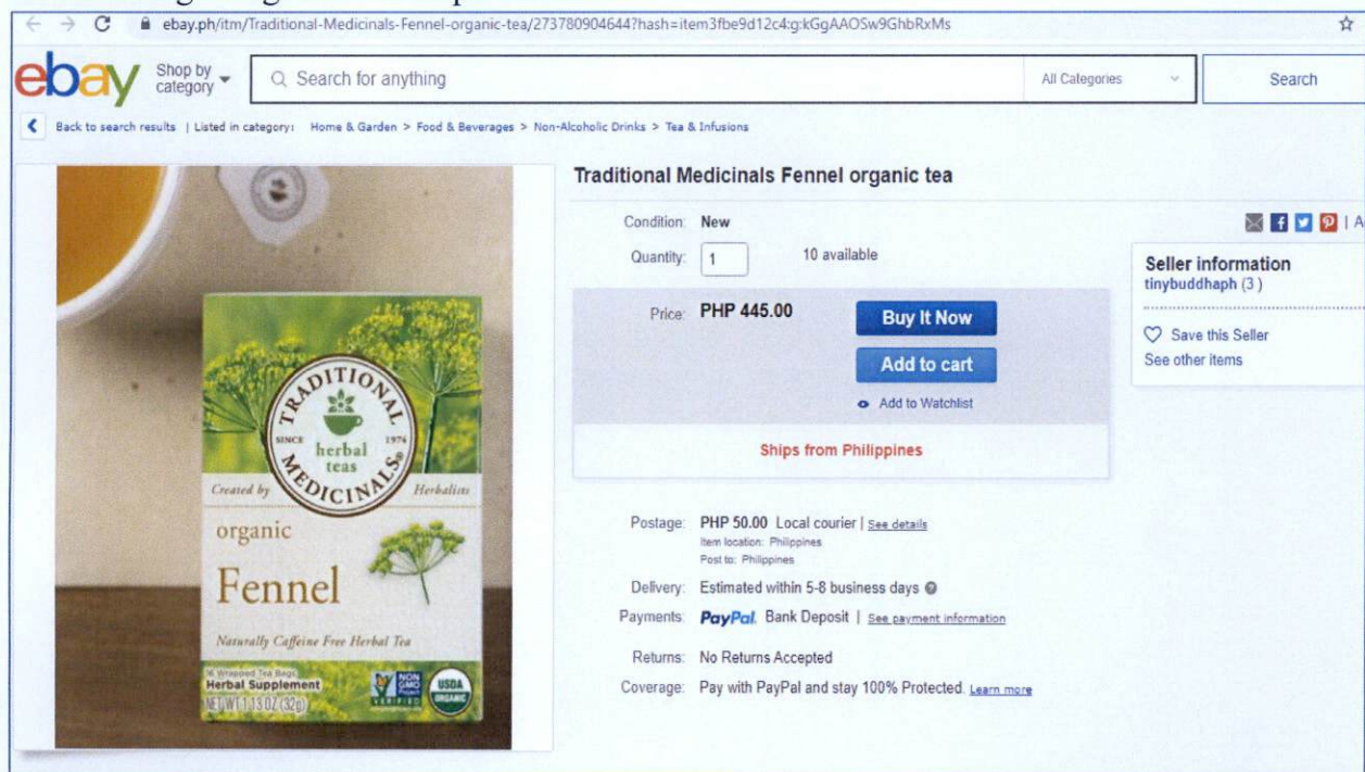
Figure 1. Unregistered TRADITIONAL MEDICINALS Organic Fennel Herbal Supplement, Tea Bags

The Food and Drug Administration (FDA) warns the public from purchasing and consuming the following unregistered food products: