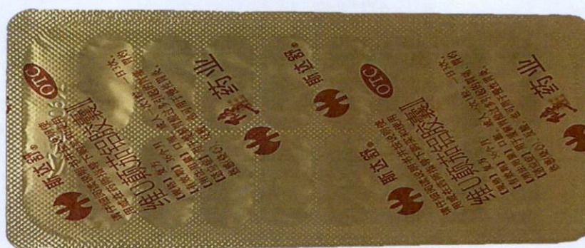
OTC Wei U Dianqie Lü Jiaonang II - Vitamin U, Belladonna and Aluminium Capsules II [as reflected in the package insert]