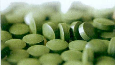
Figure 2. Unregistered Spirulina Tablets Food Supplements