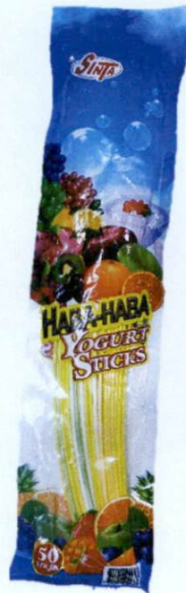
Figure 1. Unregistered SINTA Haba-Haba Yogurt Sticks

The Food and Drug Administration (FDA) warns all healthcare professionals and the general public NOT TO PURCHASE AND CONSUME the following unregistered food products and food supplements: