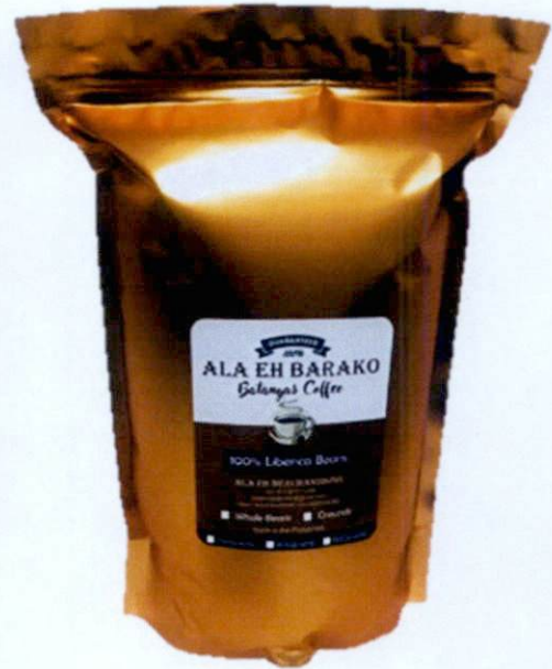
Figure 3. Unregistered ALA EH BARAKO Batangas Coffee