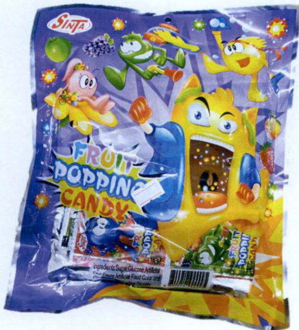
Figure 4. Unregistered SINTA Fruit Popping Candy