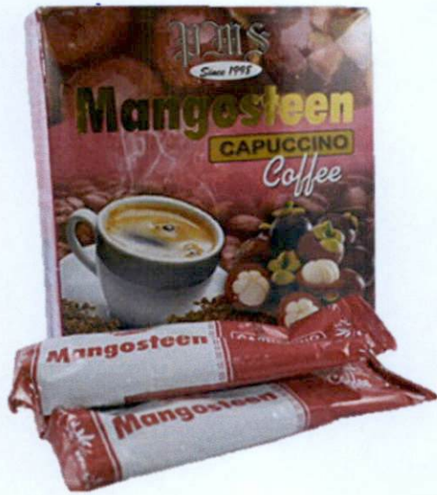
Figure 2. Unregistered PMS Mangosteen Capuccino Coffee