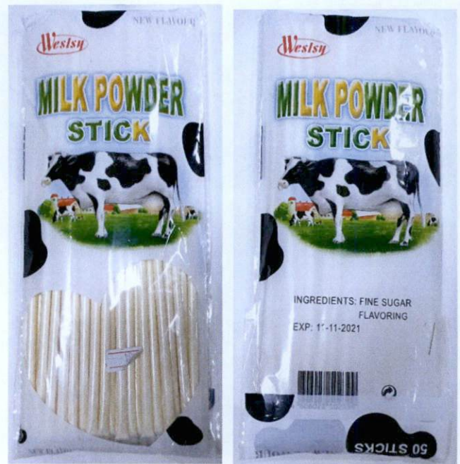
Figure 5. Unregistered WESLSY Milk Powder Stick