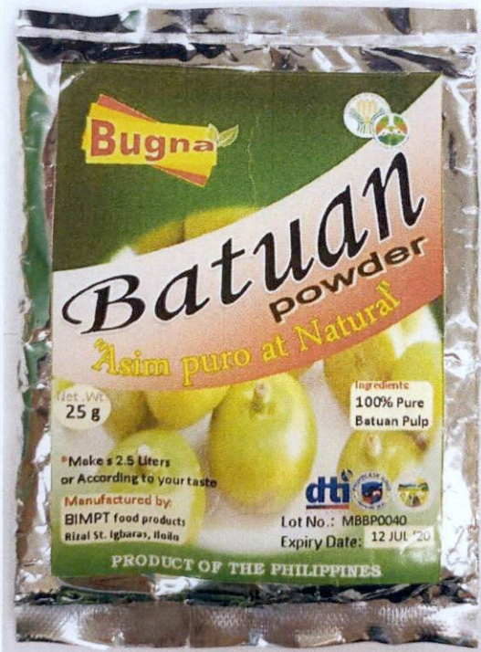
Figure 4. Unregistered BUGNA Batuan Powder