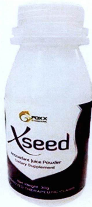
Figure 3. Unregistered GFOXX Xseed Antioxidant Juice