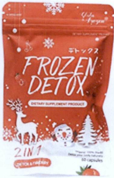
Figure 2. Unregistered FROZEN DETOX 2 in 1 Detox & Fiberry Dietary Supplement