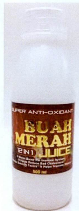
Figure 5. Unregistered 12 in 1 BUAH MERAH Juice Anti-Oxidant