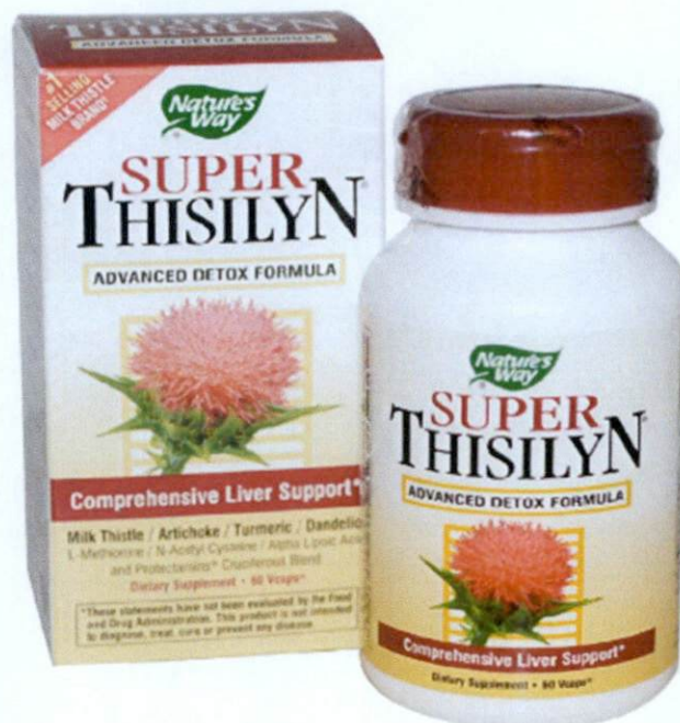
Figure 1. Unregistered NATURE'S WAY Super Thisilyn Advanced Detox Dietary Supplement

The Food and Drug Administration (FDA) warns all healthcare professionals and the general public NOT TO PURCHASE AND CONSUME the following unregistered food products and food supplement: