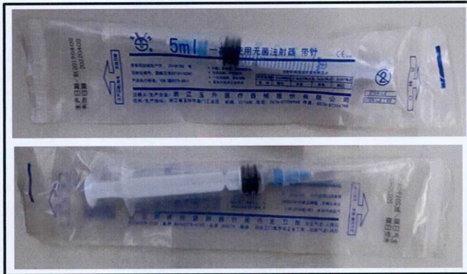
Figure 1. Unregistered “Sterile Syringe (5ml) in Foreign Characters”

The Food and Drug Administration (FDA) warns all healthcare professionals and the general public NOT TO PURCHASE AND USE the unregistered medical device product: